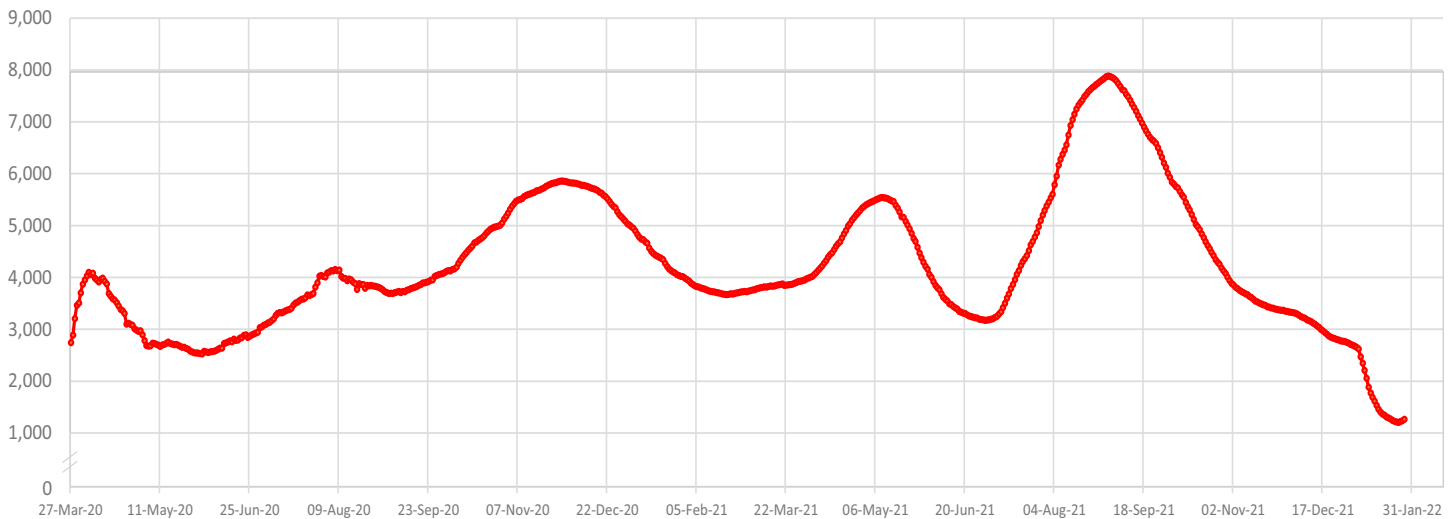
Figure 2 - COVID-19 Patients in Intensive Care, 26 March 2020 - 27 January 2022

Number of cases admitted to ICU: 1,294 ↑(+27)