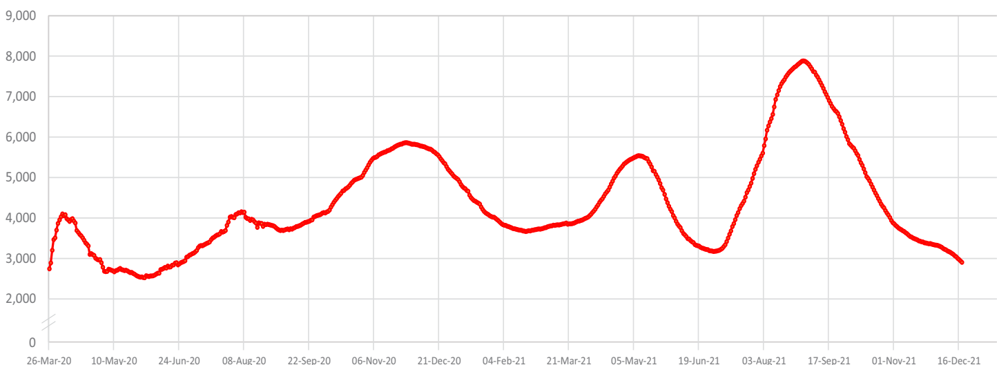
Figure 2 - COVID-19 Patients in Intensive Care, 26 March 2020 - 18 December 2021

Number of cases admitted to ICU: 2,909 ↓(-32)