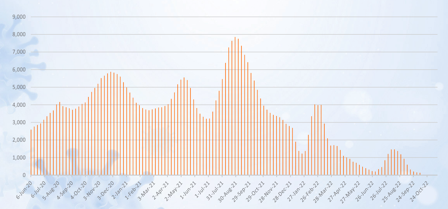
Figure 2. Weekly Trend of COVID-19 Cases in ICU, 06 June 2020-08 October 2022

Number of patients in ICU: 122 \sqrt{(-26)}