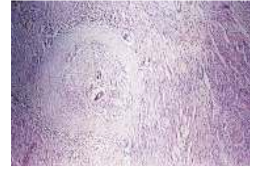
Figure 1 An epithelioid granuloma within the leiomyoma