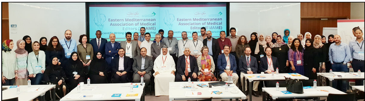
Eastern Mediterranean Association of Medical Editors (EMAME) in collaboration with Dubai Health Authority organized a three-day workshop on Scientific Writing and Publishing at Dubai from June 22-24th, 2018. The group photograph taken on this occasion shows the facilitators of the workshop with the workshop participants.