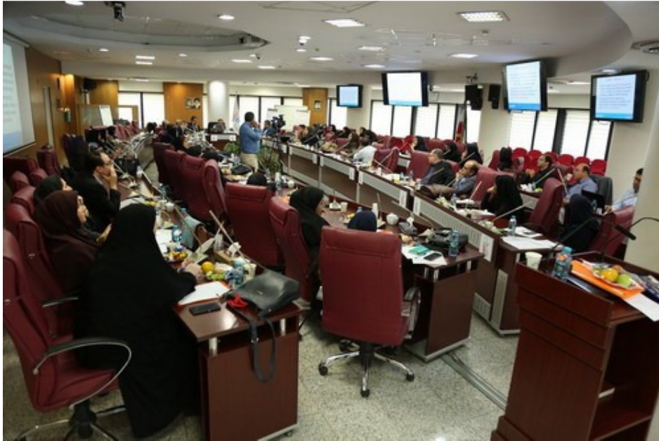
A view of the workshop on Ethics in Scientific Writing and Journal Publishing in progress at Iran University of Medical Sciences during October 2019.