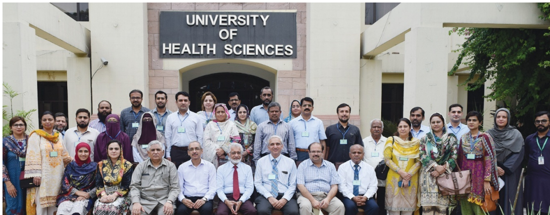
Group photograph of participants of First Certificate Course in Medical Editing organized by PAME in collaboration with EMAME at University of Health Sciences Lahore, Pakistan.