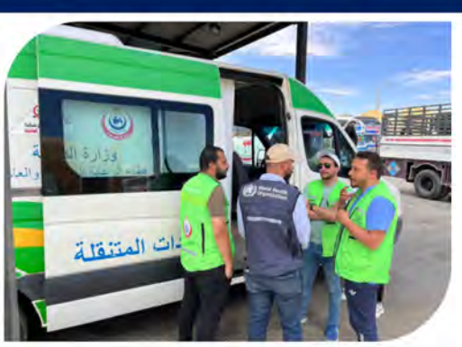
MoHP mobile clinic at Qustul border