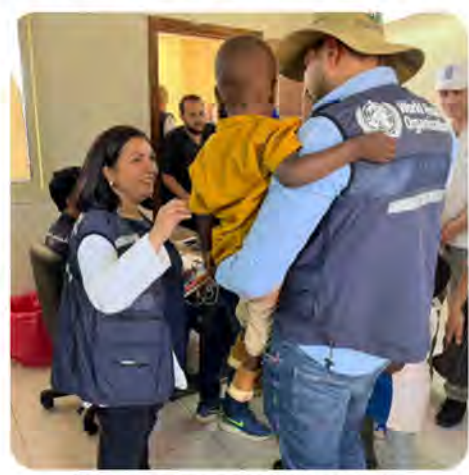
WHO Rep. in Egypt assessment visit to the borders