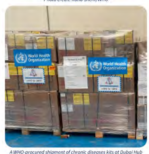
on its way to South Egypt