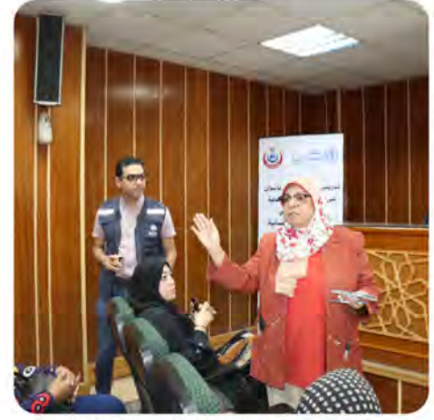
WHO training at Aswan on the health response to gender-based violence