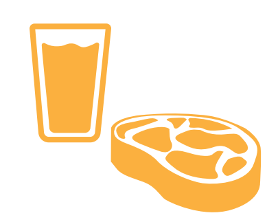
Avoid consumption of raw meat and milk from infected animals