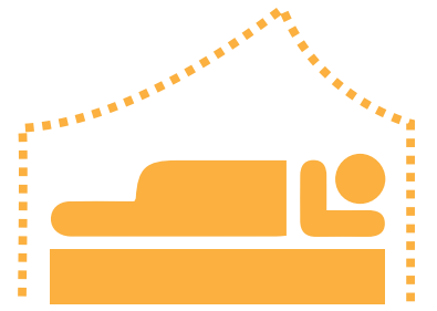
Minimize exposure to mosquitoes and ticks