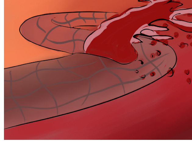
Bleeding, or haemorrhaging from orifices and internal organs