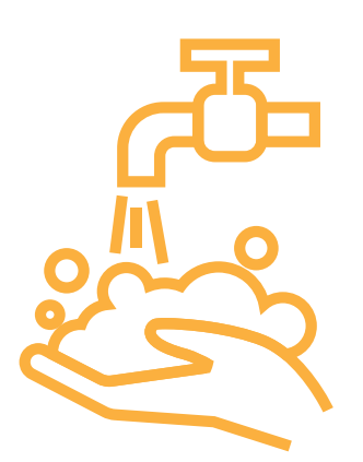
Ensure hygiene, especially hand hygiene