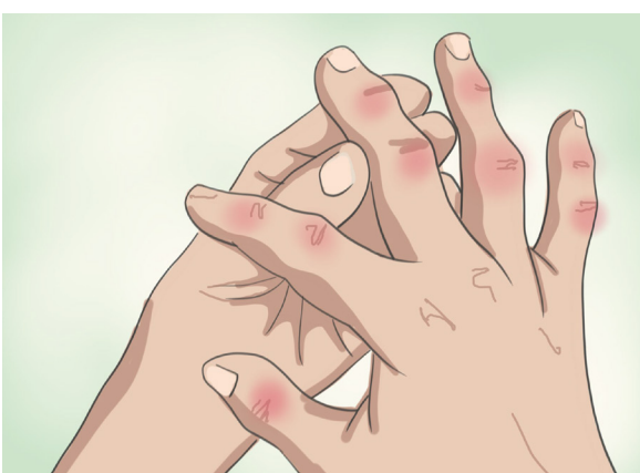
Muscle and joint pain