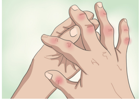
Muscle and joint pain