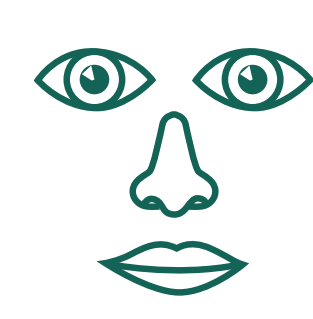
Avoiding touching face with unclean hands