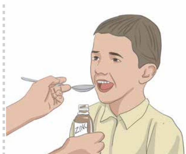
Give zinc to children