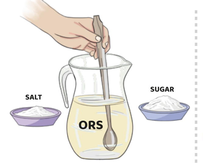
Antibiotics are for severe cases only. For mild cases, give oral rehydration salts