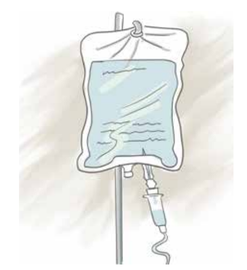
Use intravascular fluids to hydrate patients