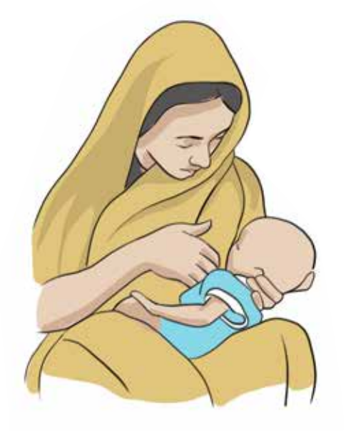
It is recommended that mothers continue to breastfeed regularly even if they have been diagnosed with cholera