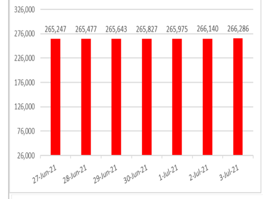
Number of New Deaths