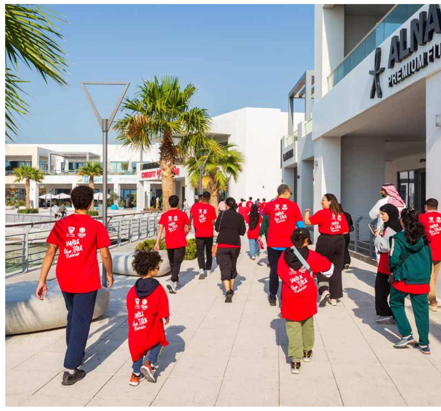
The community at large walks the talk to mark the International Day of Persons with Disabilities, 2 December 2023.

their commitment to the United Nations' principle "Nothing About Us Without Us."