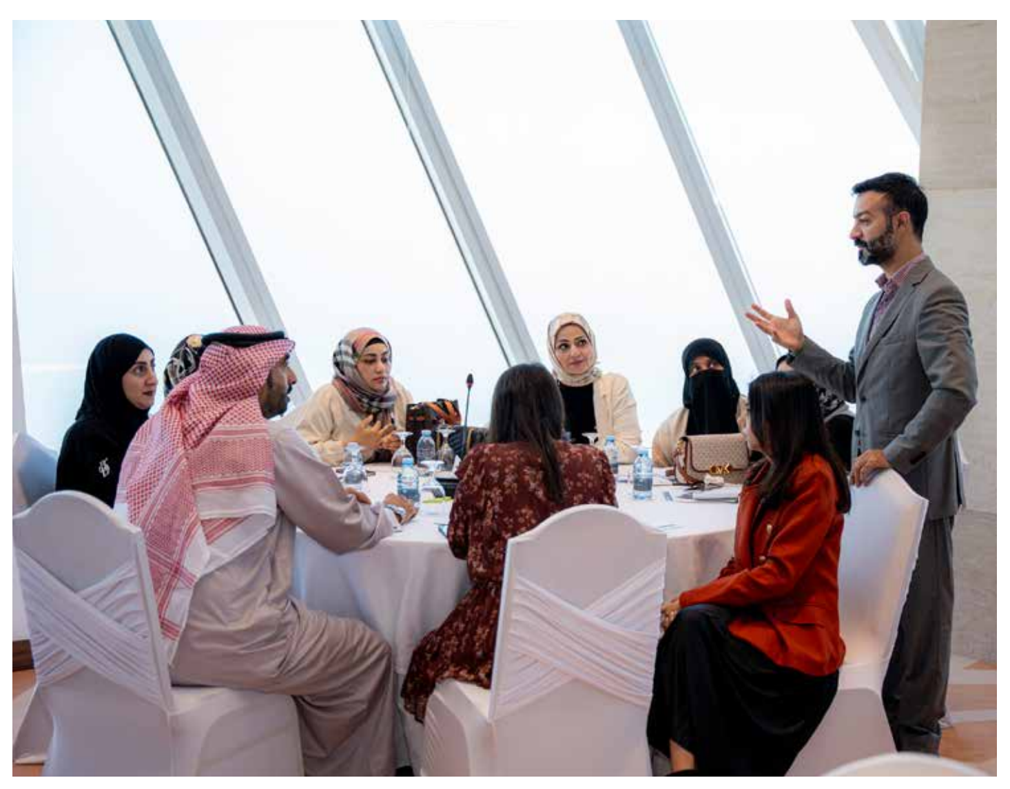
Participants engage in group work discussions during the Multidisciplinary Health Communications and Community Engagement Capacity Building Workshop, 3-5 December 2023.