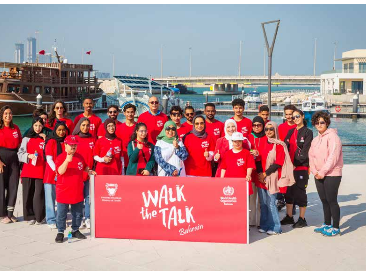
The WHO Country Office in Bahrain joins the Ministry of Health in celebrating the International Day of Persons with Disabilities, 2 December 2023.

Commemorating the International Day of Persons with Disabilities, the WHO Country Office in Bahrain and the Ministry of Health jointly hosted a "Walk the Talk" event on 2 December 2023 in Sa'ada Sea Front, Muharraq. The event was organised with support from youth volunteers whose active participation was made possible by the Ministry of Youth Affairs.