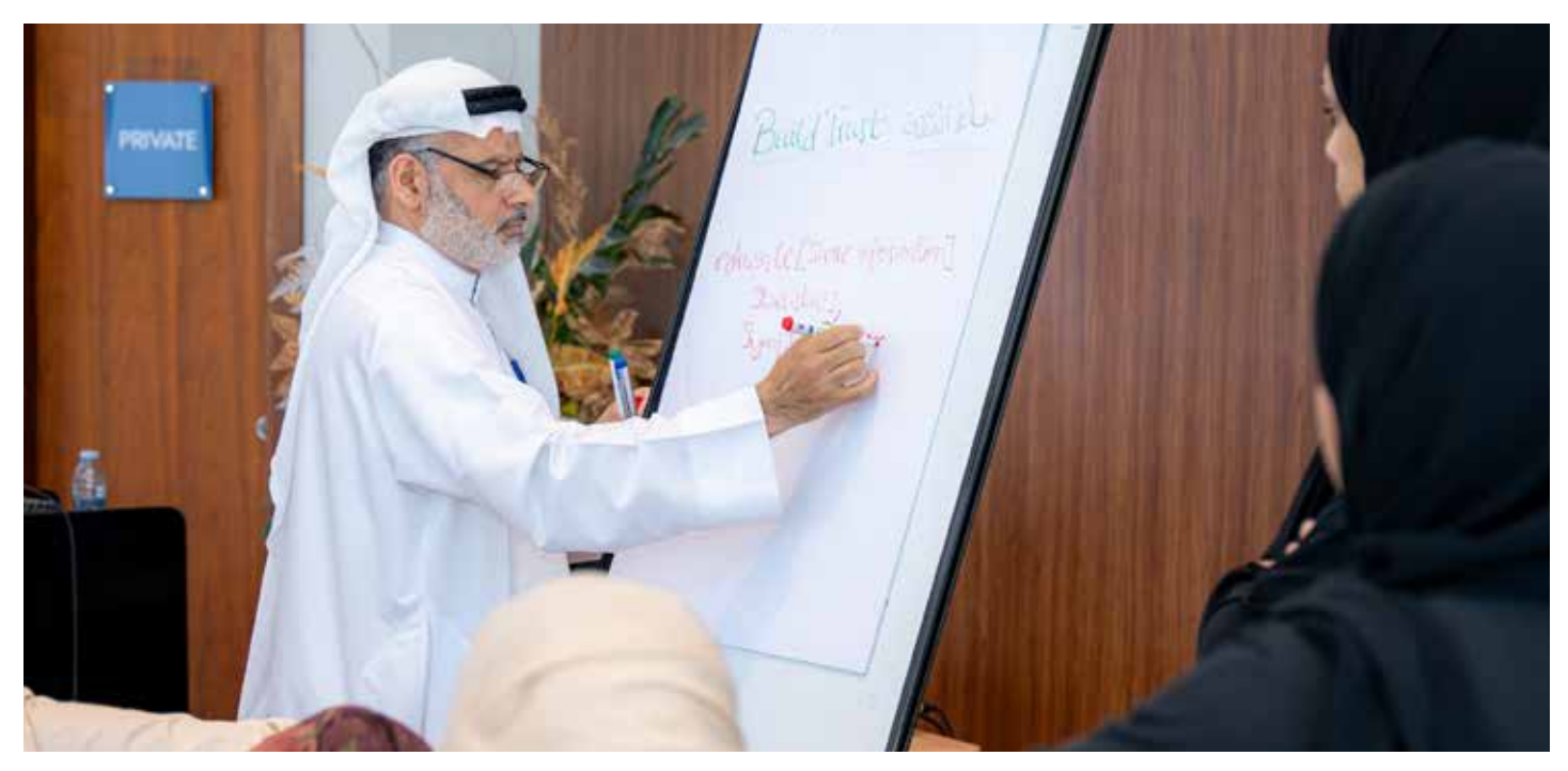
Participants engage in group work discussions during the Multidisciplinary Health Communications and Community Engagement Capacity Building Workshop, 3-5 December 2023.