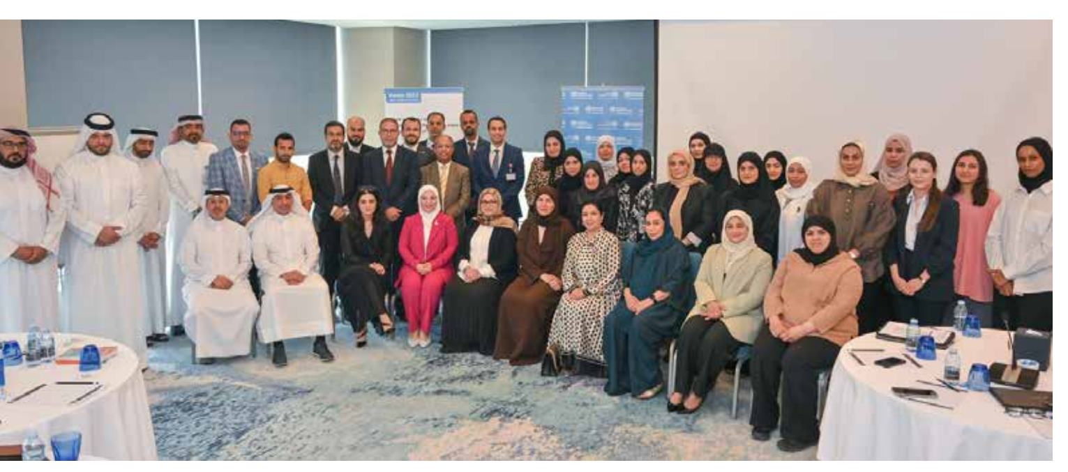
Group photo of participants during the Joint External Evaluation Workshop, 3-5 September 2023, Manama, Bahrain

More than 35 experts from different sectors participated in the workshop. They included professionals from the following ministries: Health, Foreign