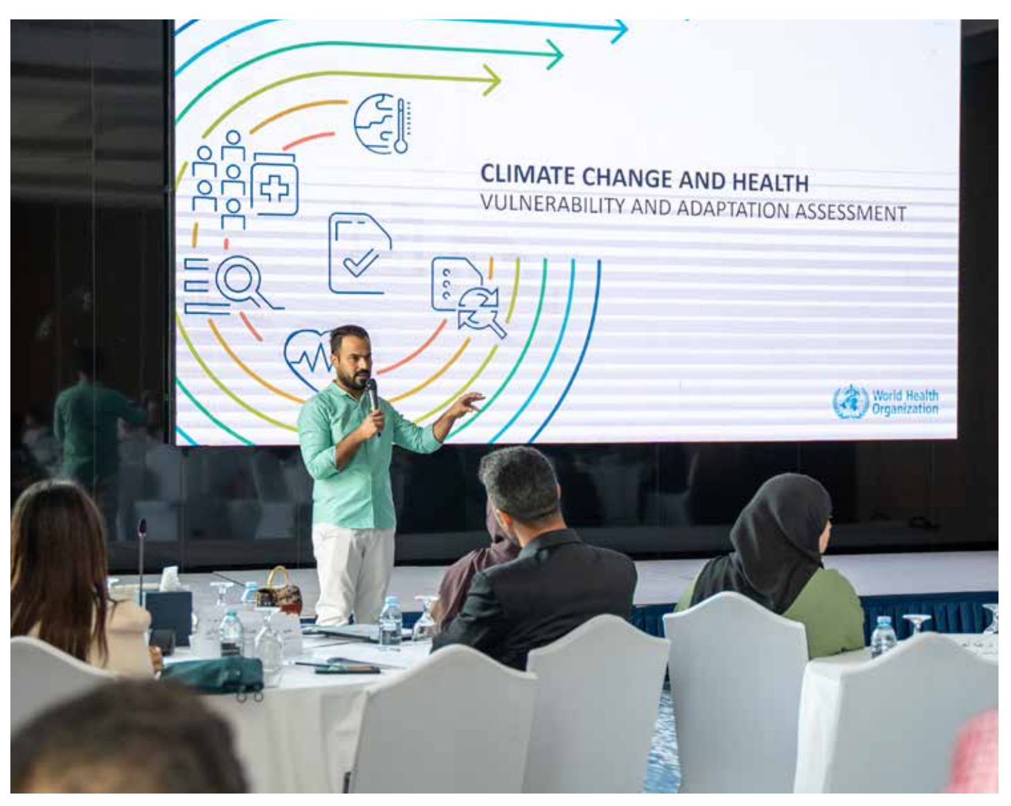
Facilitators in open discussions during the Workshop on Conducting Climate Change and Health Vulnerability and Adaptation Assessment and the Health National Adaptation Plan, 29-30 October 2023.

discussions revolved around the need for further capacity-building and awareness-raising on the impacts of climate change on health and wellbeing. Moreover, the participants worked with one another to identify opportunities and good practices for developing the HNAP for Bahrain.