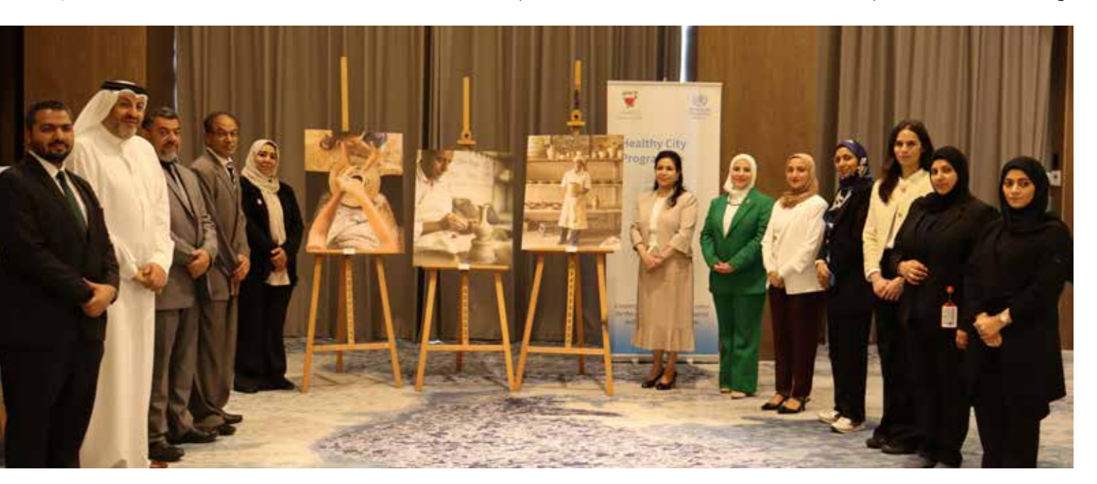
Participants of the Healthy Cities Exchange of Experiences Workshop and Photography Exhibition, 5 October 2023.

As a strategic vehicle for health development and wellbeing