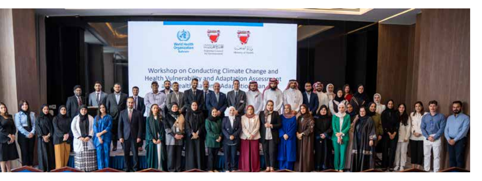
Group photo of the participants at the Workshop on Conducting Climate Change and Health Vulnerability and Adaptation Assessment and the Health National Adaptation Plan, 29-30 October 2023.

The WHO Country Office in Bahrain, under the guidance of the Supreme Council for Environment and the Ministry of Health, organised a workshop on Conducting Climate Change and Health Vulnerability and Adaptation Assessment and the Health National Adaptation Plan (HNAP) between 29-30 October 2023.