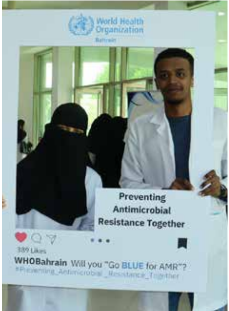
Students and academic staff take photos in an AMR photobooth cardboard frame during World AMR Awareness Week, 22 November 2023.

attendees received a WHO "Will you go blue for AMR?" branded tote bag to spread awareness about antibiotic abuse and encourage positive behaviour changes in the community.