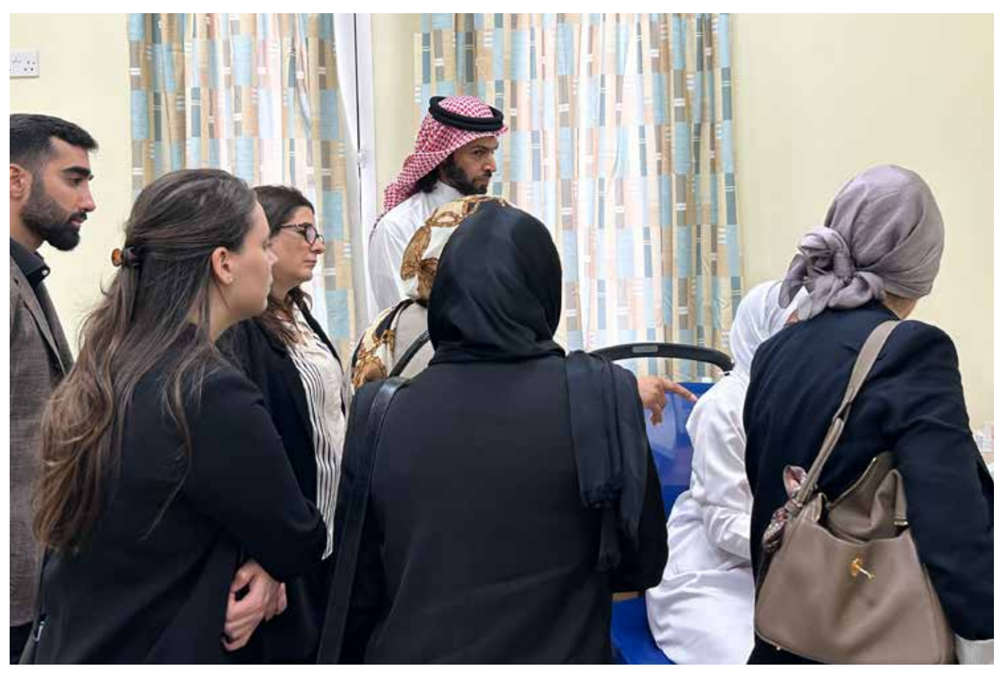
The WISN technical task force visits a primary healthcare facility in the Muscat Governorate, 30-31 July 2023, Oman.

following the launch of a national initiative to identify the health workforce requirements at the primary healthcare level under the direction of the Supreme Council of Health, Ministry of Health, and Primary Healthcare