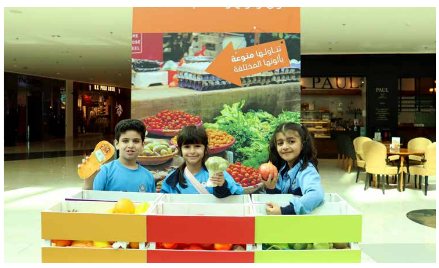
The Food-Based Dietary Guidelines Exhibition, 10-14 December 2023