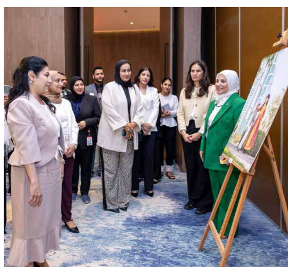
Participants of the Healthy Cities Exchange of Experiences Workshop and Photography Exhibition, 5 October 2023.

Following the workshop, the participants were invited to the Healthy Cities Photography Exhibition, which showcased the unique features of Bahrain's four Healthy Cities: Umm-Al-Hassam-Living in Heritage, Manama – Living in Entrepreneurship, Busaiteen/AlSayah – Living in Knowledge, and A'ali – Living in Art.