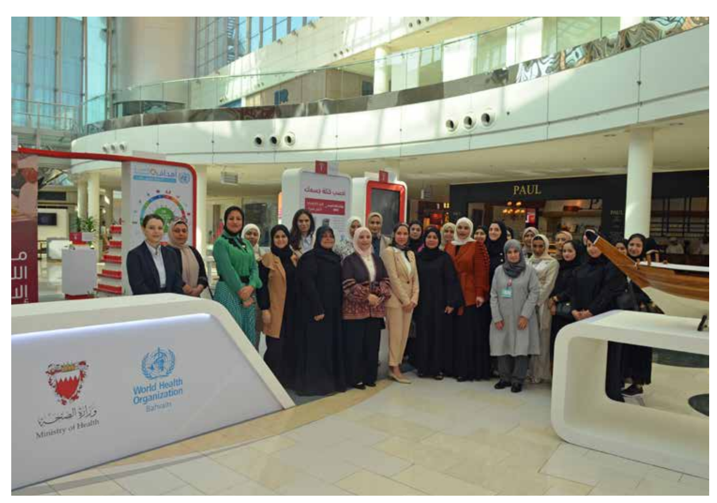
The Ministry of Health and WHO Country Office in Bahrain inaugurate the Food-Based Dietary Guidelines Exhibition, 10-14 December 2023.

The Food-Based Dietary Guidelines consist of 11 key messages designed to serve policymakers, health professionals, and the general public in promoting a healthy, nutritionally adequate diet. They were developed by the Ministry of Health with WHO technical support. The Guidelines were launched at the conclusion of the joint mission of the United Nations Interagency Task Force on the Prevention and Control of NCDs (UNIATF) and WHO in Bahrain in November 2021.