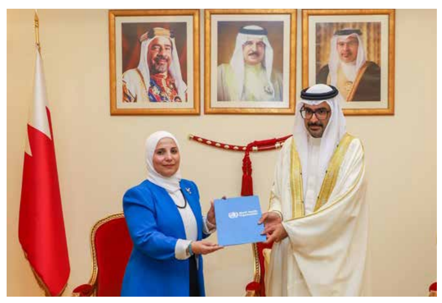
The Southern Governorate signs formal Letter of Collaboration with the WHO Country Office in Bahrain to expand implementation of Healthy Cities Programme,4 September 2023.

of the Capital Governorate; and Dr Tasnim Atatrah, WHO Representative in Bahrain.