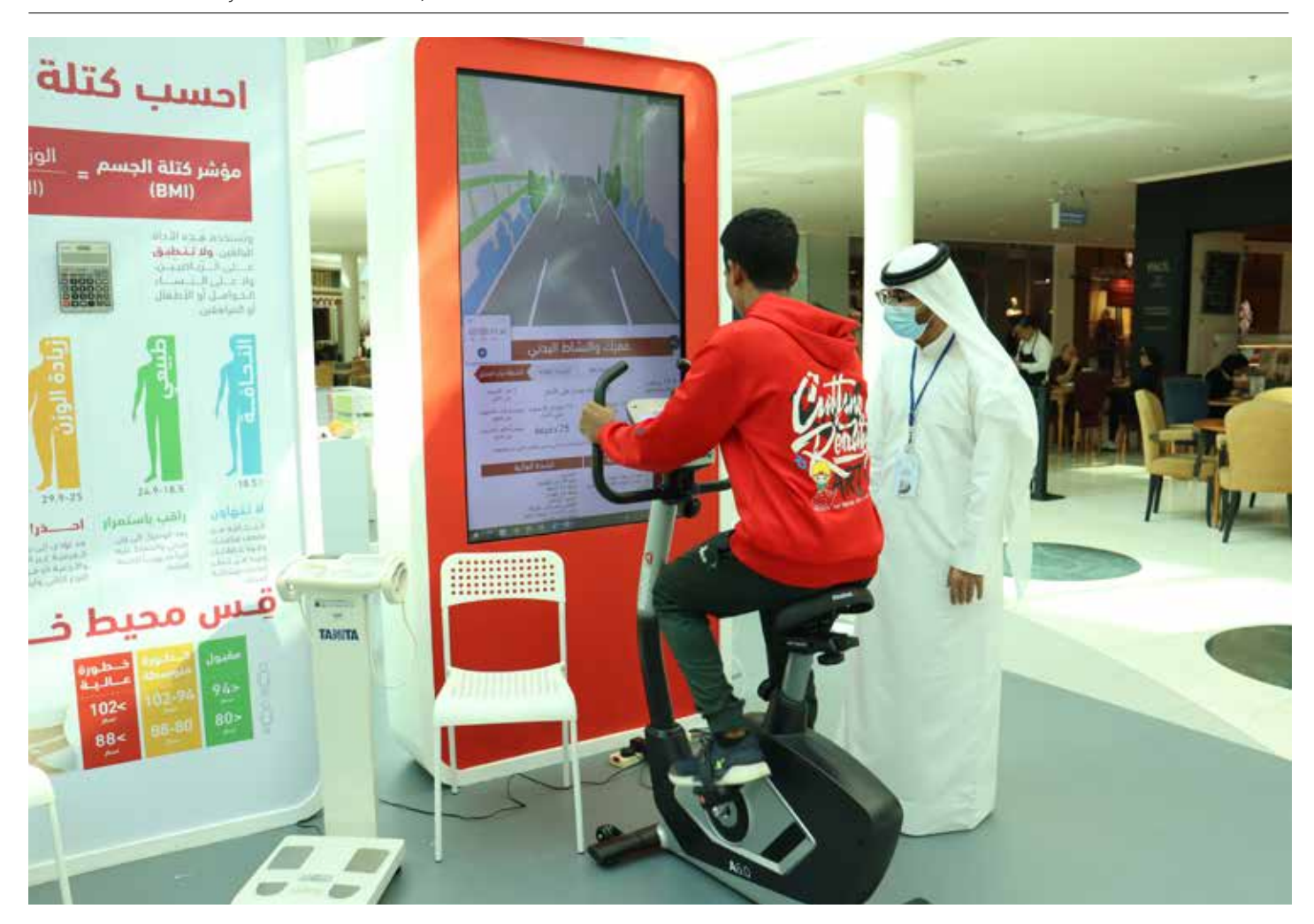
The Food-Based Dietary Guidelines Exhibition, 10-14 December 2023