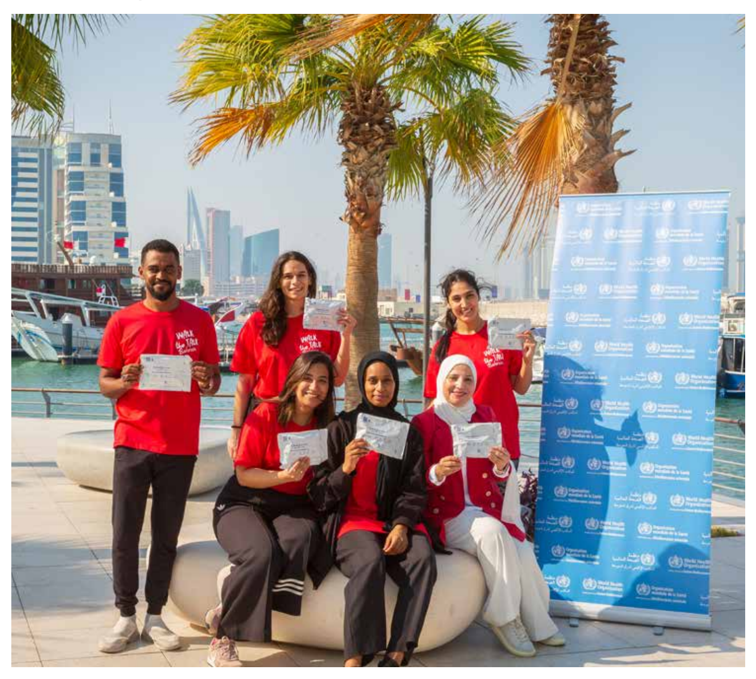
The WHO Country team joins in the global campaign for World AIDS Day, 2 December 2023.

joined in the global campaign to mark World AIDS Day by undertaking HIV self-tests to raise awareness of the importance of