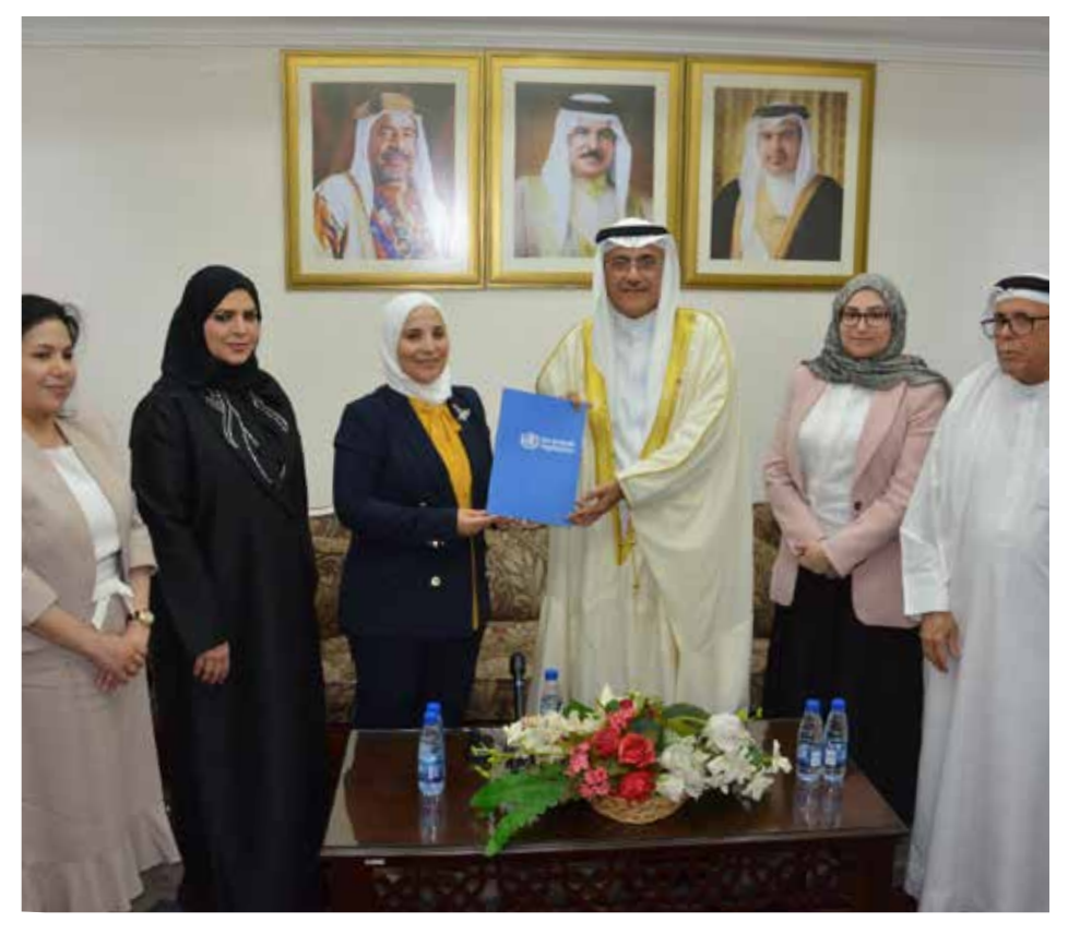
The Northern Governorate signs formal Letter of Collaboration with the WHO Country Office in Bahrain to expand implementation of Healthy Cities Programme, 14 August 2023.