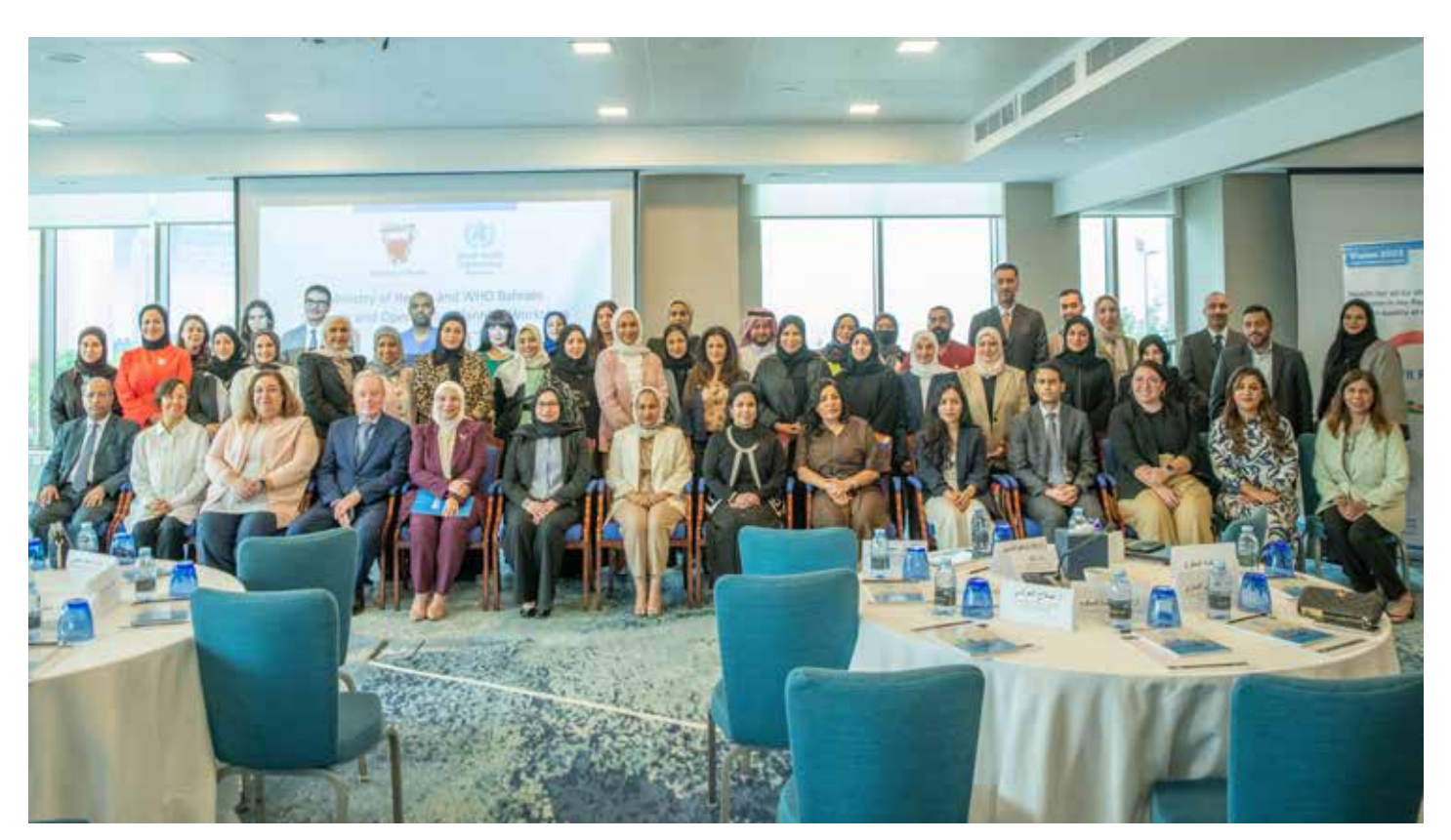
Group picture of participants at the Strategic and Operational Planning Workshop, 15-16 November 2023.

informed the identification of several strategic priorities for WHO support for the next three years. These include (1) promoting health through transformative action on climate change and the social determinants of health; (2) providing health through expanding coverage of essential health services to achieve universal health coverage; (3) protecting health by taking action to strengthen health emergency prevention, preparedness, response and resilience; (4) reinforcing the use of evidence from data and science and translating innovations into interventions and national decision-making; and (5) strengthening health diplomacy, collaboration and partnership as