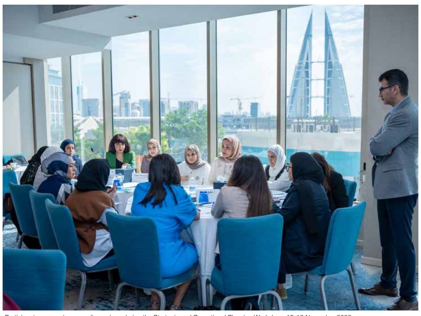
Participants engage in group discussions during the Strategic and Operational Planning Workshop, 15-16 November 2023.

well as advocacy and strategic communications.