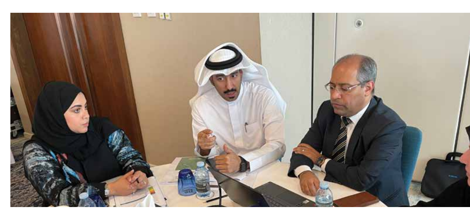
Participants engage in group work discussions during the Joint External Evaluation Workshop, 3-5 September 2023.

Moving forward, the identified actions and outcomes from the second round of JEE will inform an update of the National Action Plan for Health Security to strengthen national capacities and country preparedness for all-hazard emergencies towards ensuring that 1 billion more people are better protected from health emergencies.