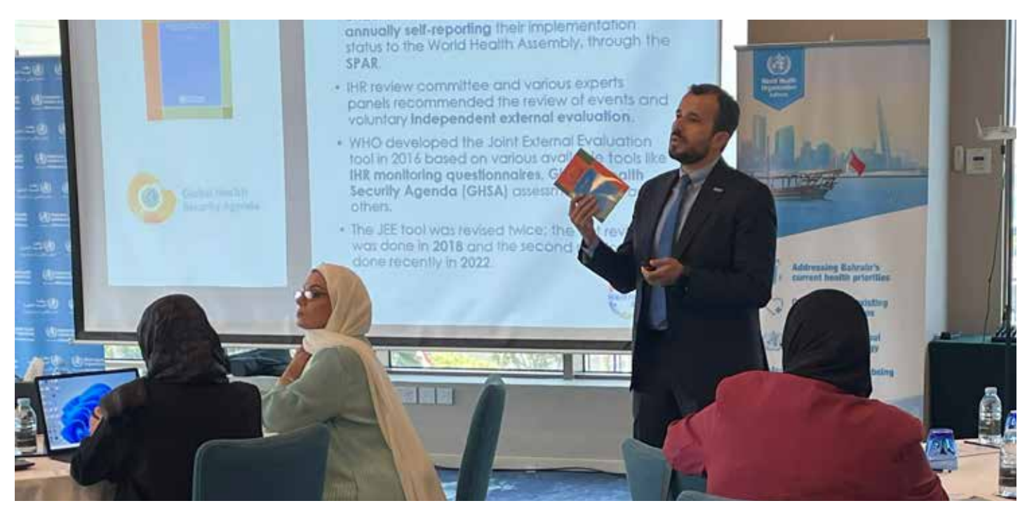
Facilitators during the Joint External Evaluation Workshop, 3-5 September 2023.

Affairs, Industry and Commerce, Municipalities and Agriculture, Interior, and Transportation and Telecommunications. Among the participants were also experts from the Primary Healthcare Centres, Government Hospitals, National Health Regulatory Authority, National Oil and Gas Authority, and Bahrain Airport Services.