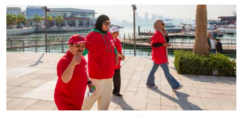
Members of the disability community join the Walk the Talk event to promote inclusive and accessible society for all, 2 December 2023.

The International Day of Persons with Disabilities is a United Nations Day celebrated every year on 3 December. It aims to promote the rights and wellbeing of persons with disabilities at every level of society. WHO joins other partners worldwide on this day to call for innovation and transformative solutions to achieve Health for All.