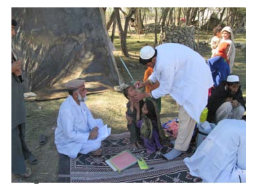
HNTPO mobile health team providing healthcare services to NWA refugees in Khost Province