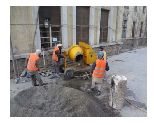
Renovation works in the isolation unit of Kabul's Infectious Diseases Hospital