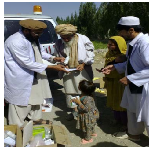
Outreach service delivery by IMC in Paktika province's Urgun district for NWA refugees