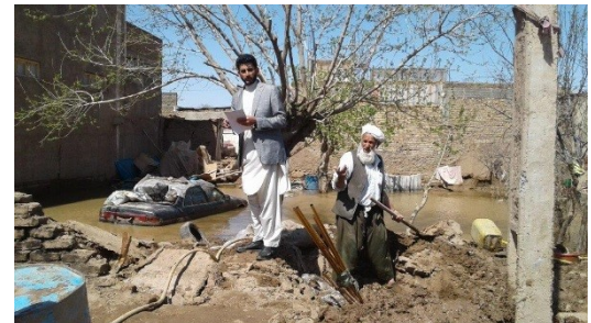
Floods caused damage in Herat province