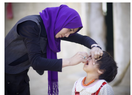
A large polio campaign was carried out in 31 provinces in March, targeting 8.9 million children under the age of 5

Health Awareness Campaign Targeting Returnees and IDPs in Nangarhar in March 2017: ⇒ Focus on acute respiratory infections, cholera, diarrhoea, infection prevention, TB, measles & trauma ⇒ 225 female community health workers (CHWs) & 336 male CHWs attended health education sessions ⇒ 200 returnees & refugees, 47 community elders, 26 religious leaders and 23 teachers attended outreach sessions ⇒ Over 1.3 million people reached ⇒ 1200 minutes of health messages broadcast on local radios, 650 minutes on TV ⇒ 2700 posters & 640 leaflets distributed