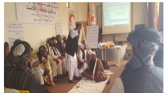
WHO-supported first aid training for community health workers in Kandahar