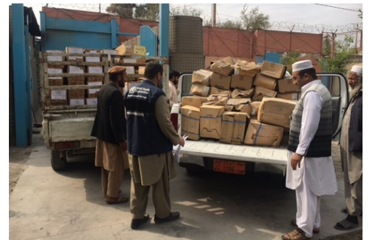
Pneumonia kits and basic health kits provided to Nangarhar and Nuristan Public Health Directorates