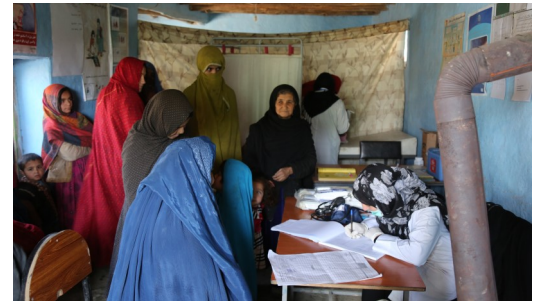
WHO supports health services in a Kabul Pul-e-Company IDP camp through a mobile clinic