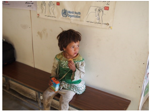
Child sits in a waiting room of a mobile clinic, one of the many that WHO supports to ensure everyone has access to basic health services