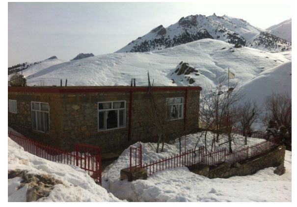
Emergency NGO's first aid post was fully operative in Panjsher province's Darband village during heavy snowfall

Sub-national immunization campaign for measles has been planned and will be conducted in Kandahar and Helmand provinces in April 2015