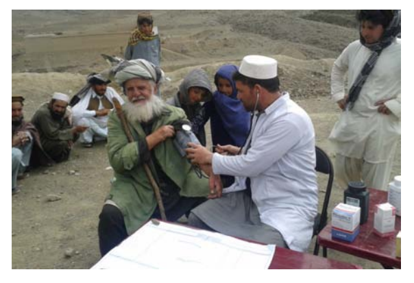
IMC providing mobile health services for North Waziristan refugees in Paktika province