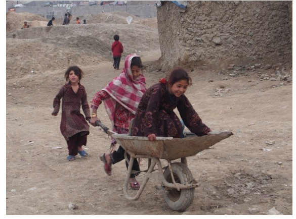
Girls playing in a camp for internally displaced people where WHO and partners support the provision of health services

www.emro.who.int/afghanistan Find us on Facebook: World Health Organization Afghanistan