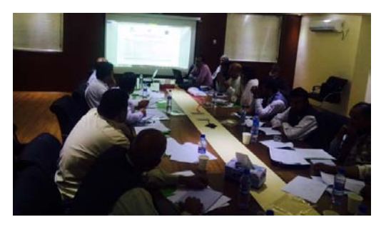
Training-of-trainers for HERA assessment focal points from 34 provinces at the Ministry of Public Health