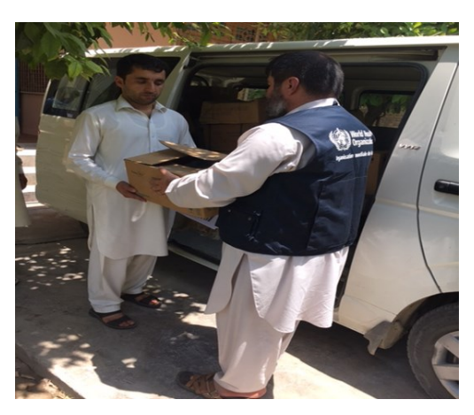
WHO distributes medical supplies and kits to WHO sub offices and Provincial Health Directorates