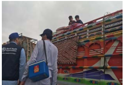
Returnees form Pakistan cross the border at Torkham to Afghanistan while polio vaccinators immunize children

trauma care unit equipped by WHO in the Kunduz Regional Hospital