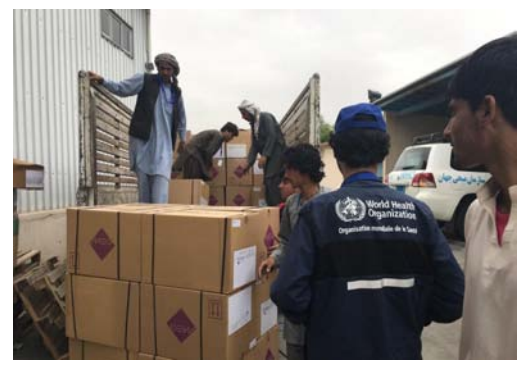
WHO supplies trauma kits to Nangarhar Regional Hospital to support mass casualty management

Humanitarian personnel, assets and facilities continue to be targeted throughout Afghanistan with 107 reported incidents affecting NGOs, UN and International Organisations in the first half of 2016. (OCHA)