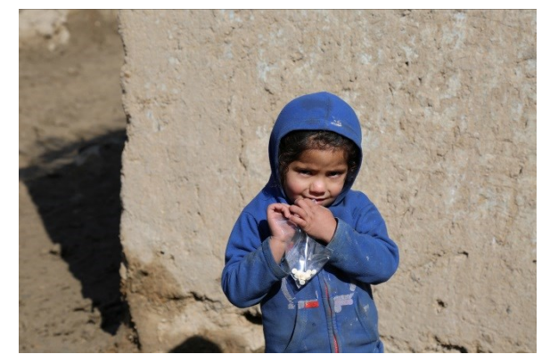
A boy received medicines to treat his respiratory infection at a WHO-supported mobile clinic in a Kabul IDP camp