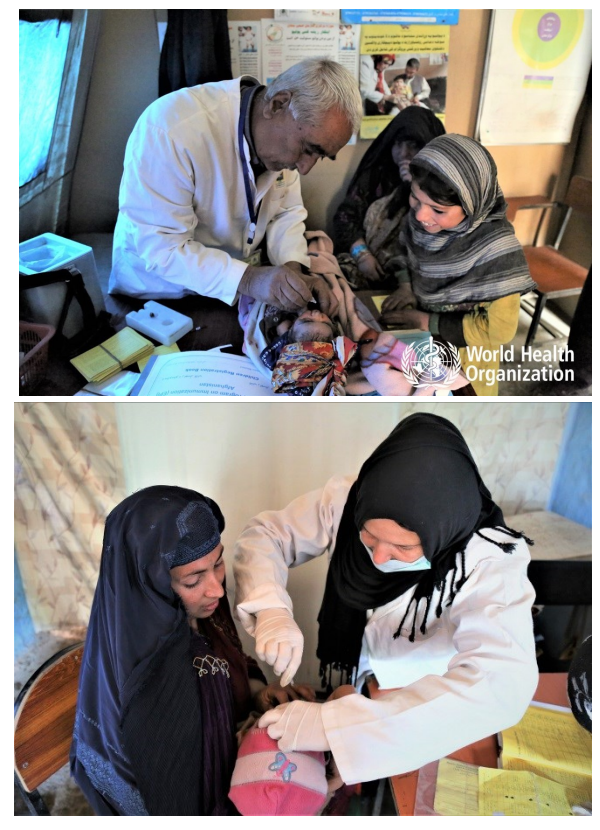
Babies receive the oral polio vaccine at WHOsupported mobile clinics for internally displaced persons in Kabul