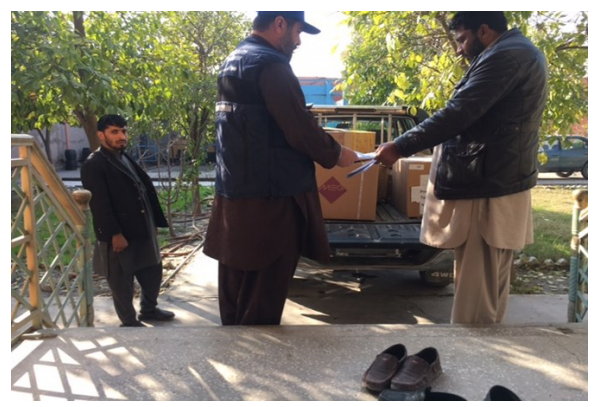
WHO delivered pneumonia kits to Nuristan as an avalanche struck the province