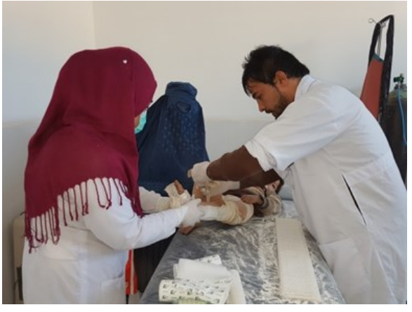
A child injured in Kunduz received trauma care services at the Kunduz regional hospital