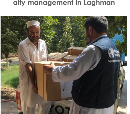
WHO supplied Pneumonia and Basic Health Kits to Kunar Public Health Directorate