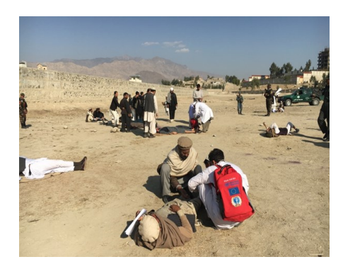
Simulation exercise on mass casualty management in Laghman