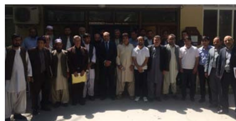
Participants of Health Emergency Risk Assessment (HERA) post-assessment workshop at the MoPH Command & Control Center

Programme Update Emergency Humanitarian Action WHO Afghanistan