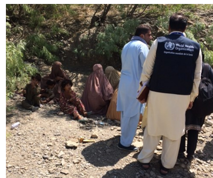
WHO Jalalabad & UN/ECHO joint mission to Torkham border to monitor and assess returnees' situation and living conditions

Afghanistan Flash Appeal 1 Million people on the Move – Health Cluster requirements: 5.4 million USD