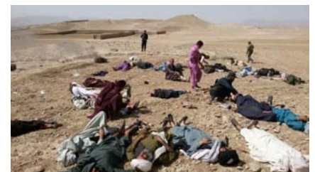
Mass casualty management exercise in Uruzgan