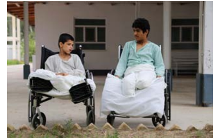
Landmine survivors receive treatment at the WHO-supported Emergency hospital in Helmand