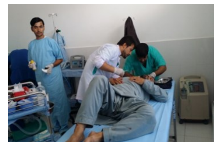
A patient is being treated in Kunduz Regional Hospital's trauma care unit