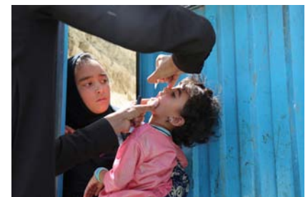
A child receives two drops of the polio vaccine in Kabul