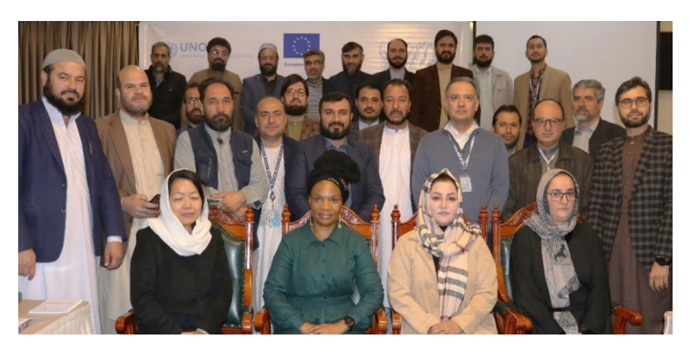
WHO-UNODC Consultative Workshop on Unification of Service Delivery and Reporting of Opioid Agonist Maintenance Treatment (OAMT) Programs in Afghanistan, November 19, 2023 - Kabul