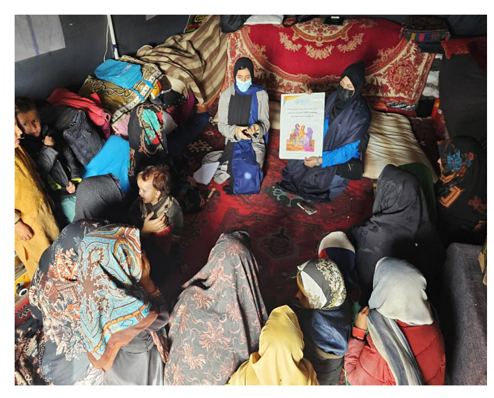
Local mobilizers talking to communities about prevention of outbreak-prone diseases