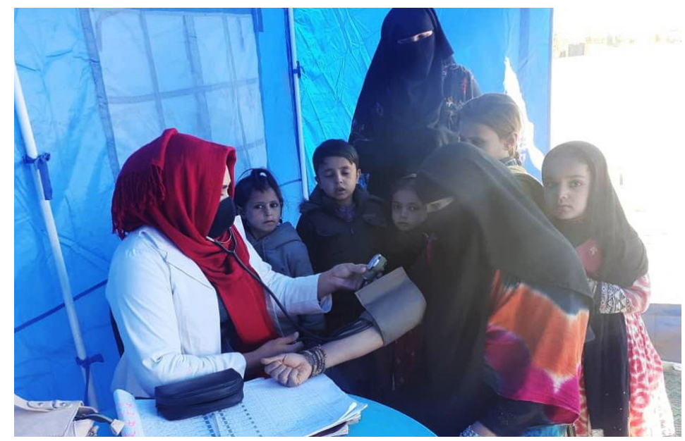
Returnees are provided with various health services.