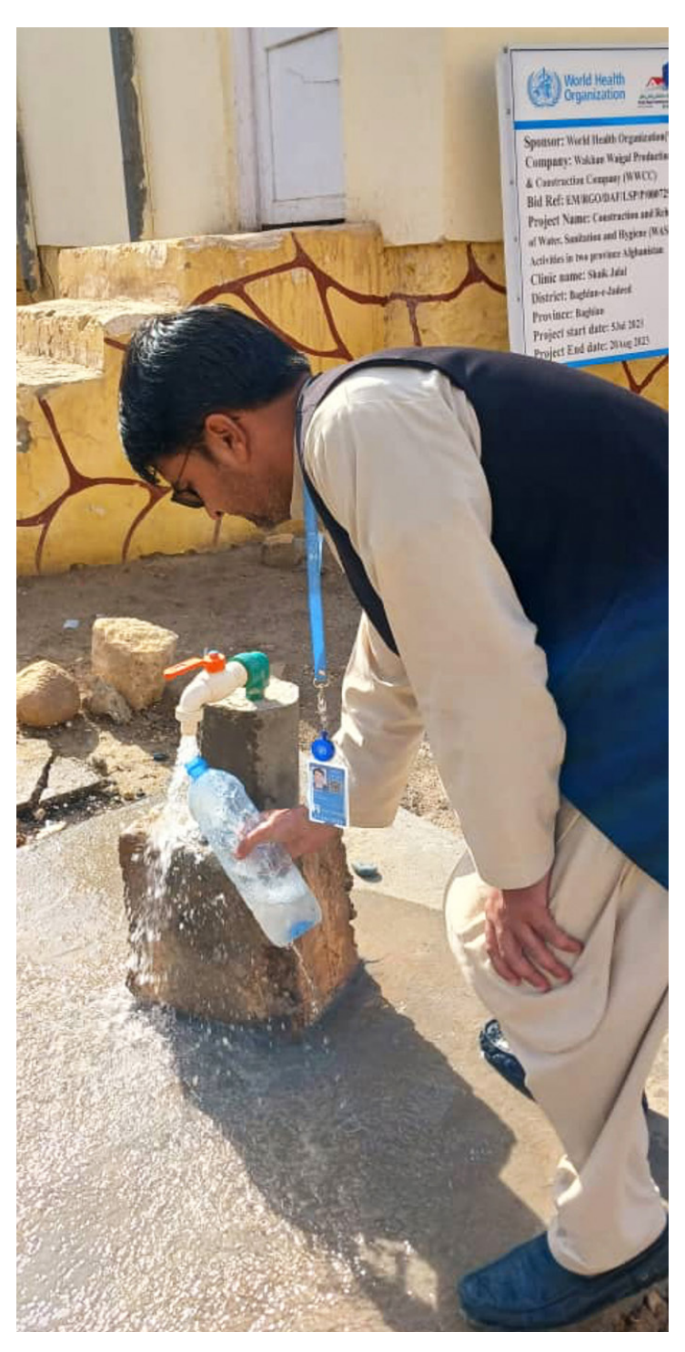
WHO's WASH team conducted water quality testing