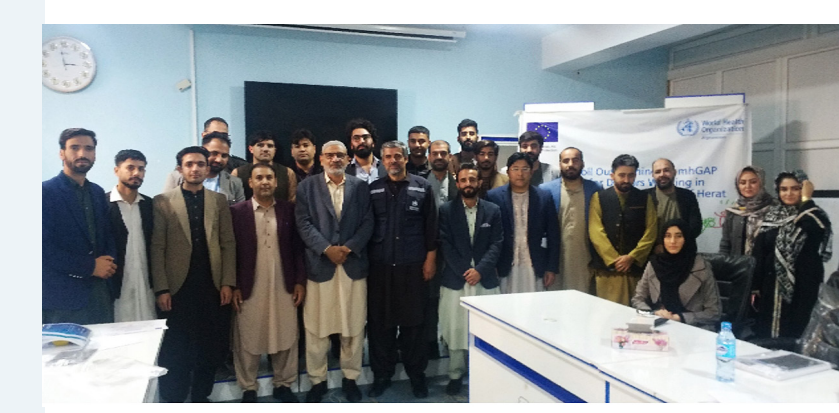
mhGAP training participants