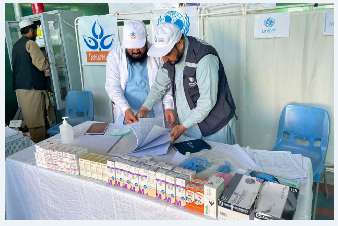
Monitoring visit from Spinboldak Zero Point clinic, Southern region