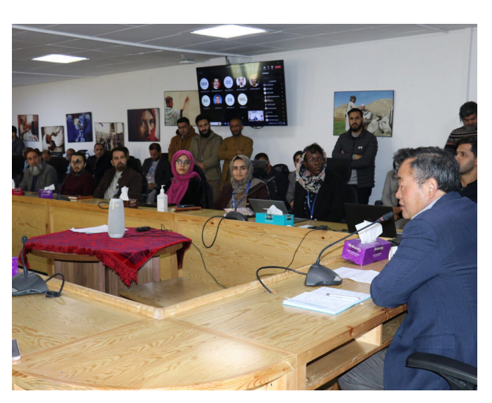
PSEAH training in WHO, Kabul