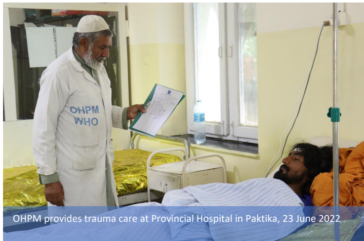
OHPM provides trauma care at Provincial Hospital in Paktika, 23 June 2022