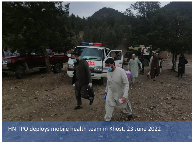
HN TPO deploys mobile health team in Khost, 23 June 2022