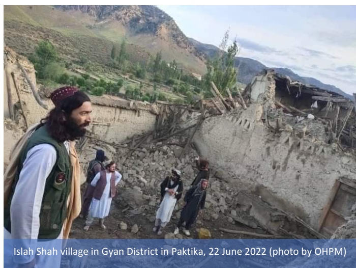
Islah Shah village in Giyan District in Paktika, 22 June 2022