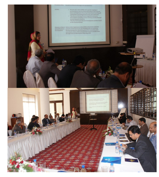
The National Disaster Management Plan was finalized in September at an event in Kabul under the leadership of Deputy Minister of Public Health Dr Najia Tariq