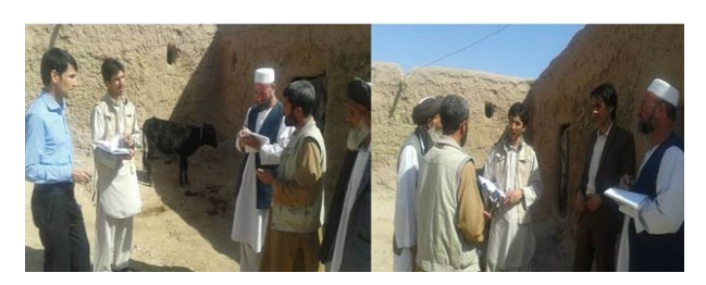
Field investigation of a CCHF case in Pashtan village in Herat's Karukh district in September