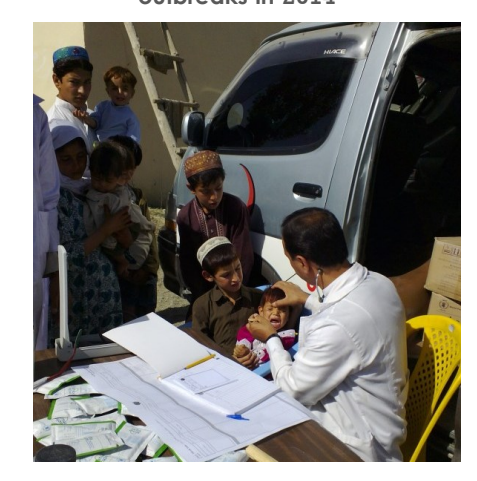
IMC delivers outreach health services to NWA refugees in Paktika's Urgun district