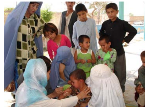
Measles vaccination campaign in flood-affected districts reached hundreds of thousands of children