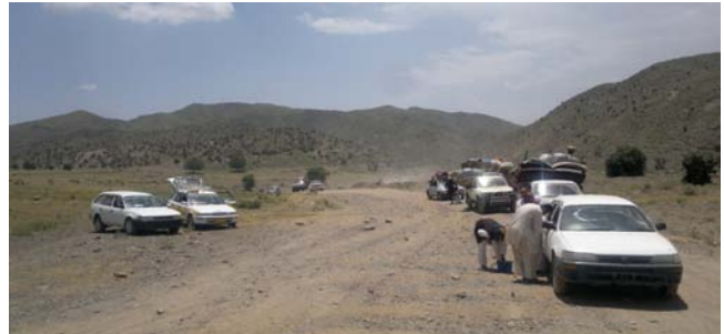
Polio vaccinators stop cars arriving from Pakistan to vaccinate children

41,196 children under 10 from North Waziristan vaccinated against polio in Khost and Paktika