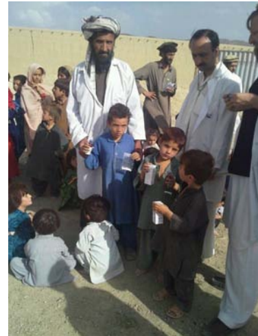
Health service delivery in Paktika