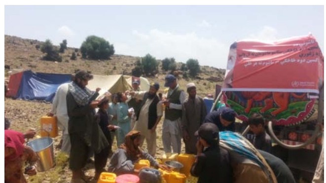
Polio vaccination teams at Gulan camp in Khost

Biweekly Programme Update Emergency Humanitarian Action WHO Afghanistan