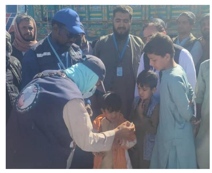
Together with the partners, WHO supports vaccination teams in Spin Boldak, Kandahar Province.