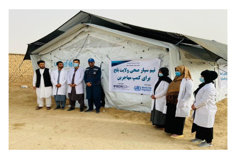
BDN/WHO established a mobile health team in a camp in Balkh Province.