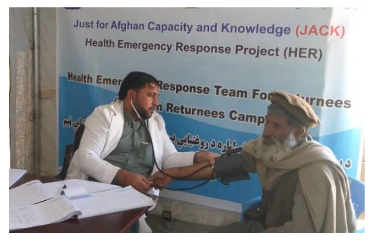
JACK has provided OPD service to the returnees in Torkham border crossing, Nangarhar Province.