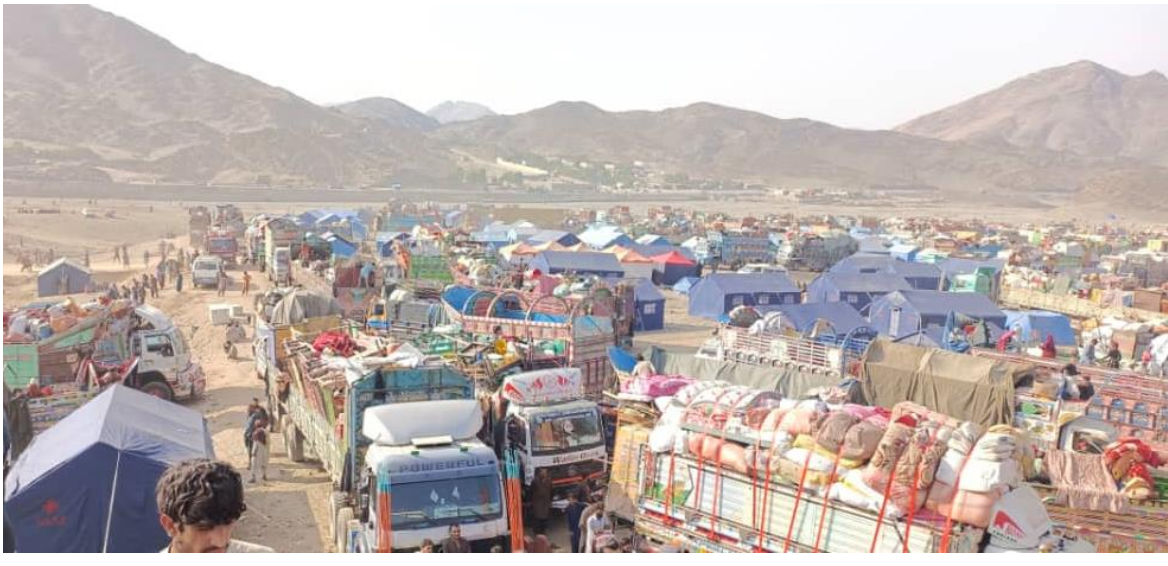
More than 233,000 Afghan returnees from Pakistan crossed the Torkham, Nangarhar Province

As of 14 November 2023, WHO and its Health Cluster partners have reached 51,494 returnees (11,205 boys, 12,749 girls, 11,348 men, 16,192 women) with various health services.