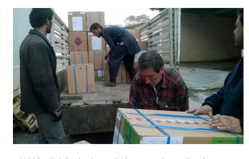
WHO distributed medicines and medical supplies to the provinces for contingency flood preparedness and response