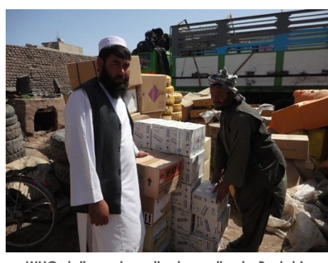
WHO delivered medical supplies to Badghis and Herat provinces

Led by WHO, the health cluster is responsible for developing and applying assessment, monitoring and information management tools to collect, analyse and manage health information during crises. An orientation workshop was conducted for key health NGOs in March to develop an online interface to ensure regular updating of the health situation and cluster activity monitoring