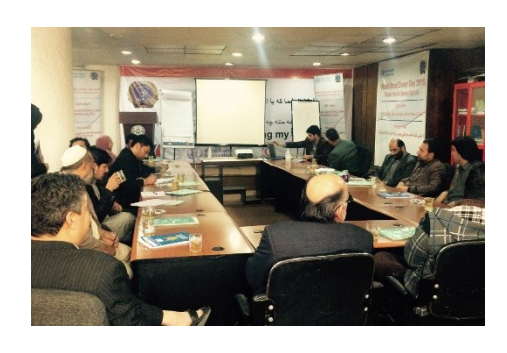
Provincial health staff are trained on the installation and use of blood bank equipment supplied by WHO to 10 provinces