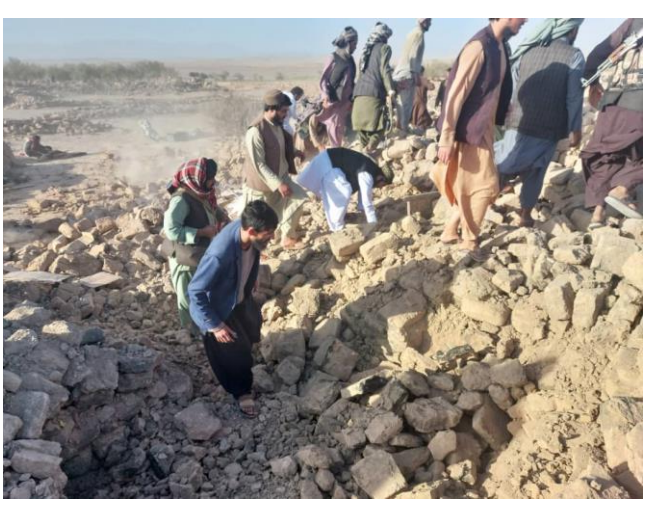
Photo 4: WHO-supported MHTs being deployed in the affected villages in Zinda Jan District.