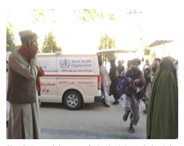
Photo 5: Herat ambulances transferring the victims to the hospitals.