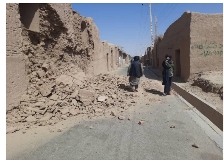
Photo 3: More than 600 houses have been fully and partially damaged.