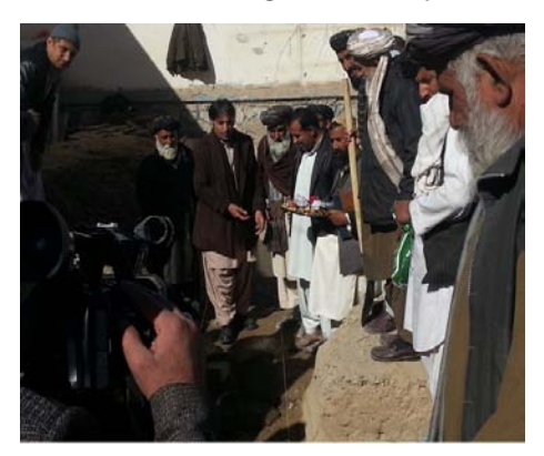
The construction of the emergency medical warehouse in Spinboldak in Kandahar was completed