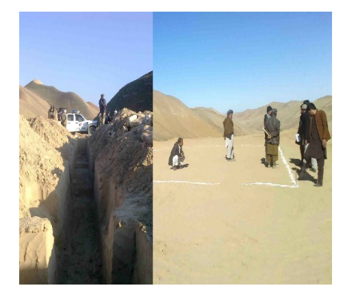
Construction of Ganda basic health centre in Sayad district of Saripul province