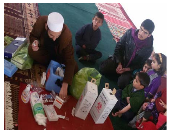
Measles campaign in Chaghcharan district of Ghor province during January 2015

The mild winter may bring about drought and water scarcity during the coming summer which could lead to water-borne disease outbreaks – action must be taken now to enhance the readiness and preparedness of communities and health services