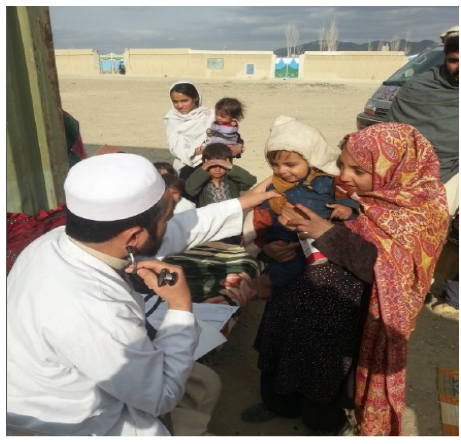
IMC providing mobile health services for North Waziristan refugees in Paktika province