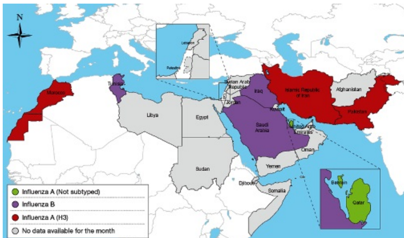
Map 1. Circulating influenza viruses in the Eastern Mediterranean Region, January 2017

Disclaimer: The presentation of material on the maps contained herein does not imply the expression of any opinion whatsoever on the part of the World Health Organization concerning the legal status of any country, territory, city or areas or its authorities of its frontiers or boundaries. Dotted lines on maps represent approximate border areas for which there may not yet be full agreement.