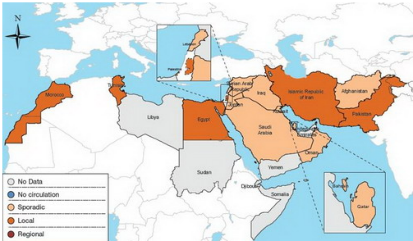
Fig. 1. Influenza activity in Eastern Mediterranean Region, December 2017 Influenza activity by sub-type

In the WHO Eastern Mediterranean Region, influenza activity is high in the month of December in many countries reporting data to FluNet and EMFLU namely, Afghanistan, Bahrain, Egypt, Iran (Islamic Republic of), Iraq, Jordan, Kuwait, Lebanon, Morocco, Oman, occupied Palestinian territories (oPt), Pakistan, Qatar, Syrian Arab Republic, Saudi Arabia, and Tunisia (Fig. 1). All seasonal influenza subtypes were detected in the Region.