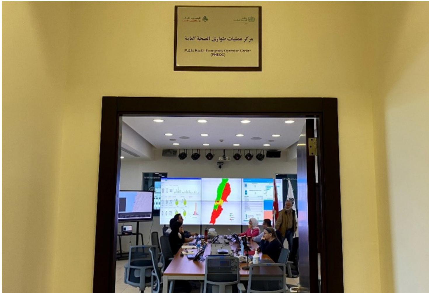
The updated PHEOC, a joint venture by the Ministry of Public Health and WHO, is located on the Ministry's premises.

19 December 2023, Beirut, Lebanon – Lebanon is no stranger to emergencies. The country has known war and, in recent years, has had to contend with the COVID-19 pandemic, the Beirut port blast and a crippling economic crisis. Now, conflict has hit the south of the country, and there is a risk it may spread north.