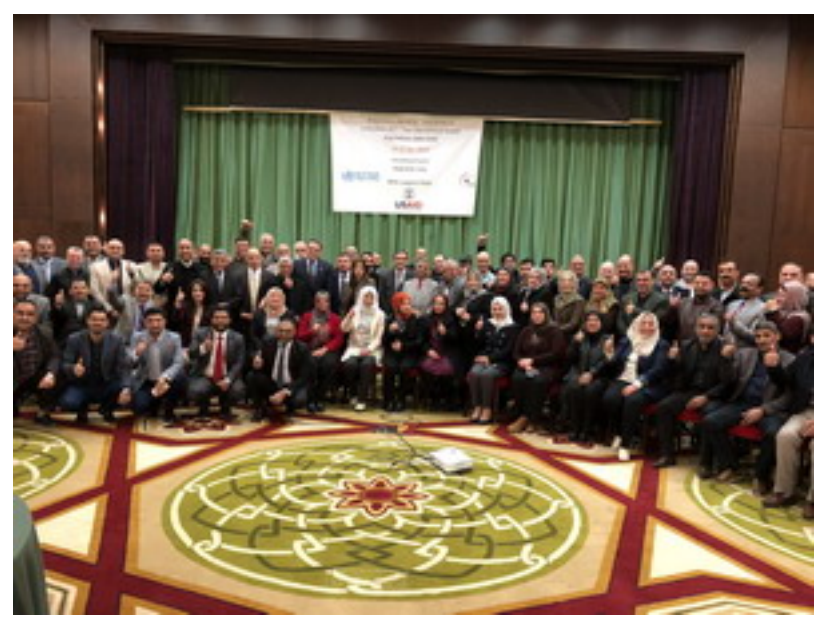
16 January 2019 – Under the patronage of H.E. the Minister of Health of Iraq Dr Alaa Alwan, a preparatory meeting for the joint external evaluation (JEE) was conducted on 14 15 January 2019, in Baghdad.

The meeting was organized jointly by the World Health Organization (WHO) and the Ministry of Health to train national stakeholders on the JEE tool and process. Seasoned experts from the WHO regional Health Emergencies Programme provided on-site support to the countrywide workforce to conduct the self-assessment process, an essential exercise to gauge the capacities and preparedness of Iraq's health system to respond to public health emergencies.