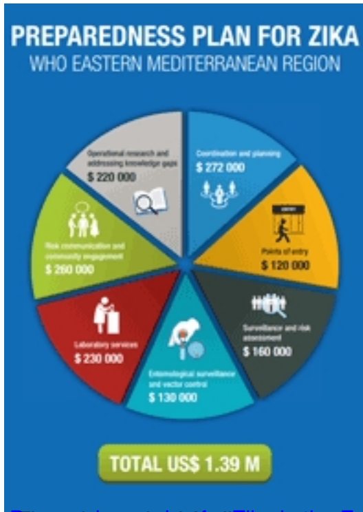
Thursday 18th of April 2024 05:42:28 PM Mediterranean Region [flyer]