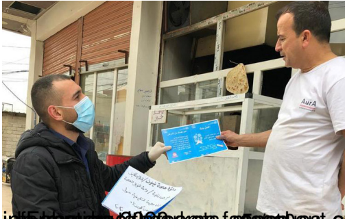
in Iraq, WHO worked with the Ministry of Health to create an educational