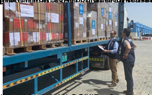
WHO is also working with the Ministry of Health to create an educational