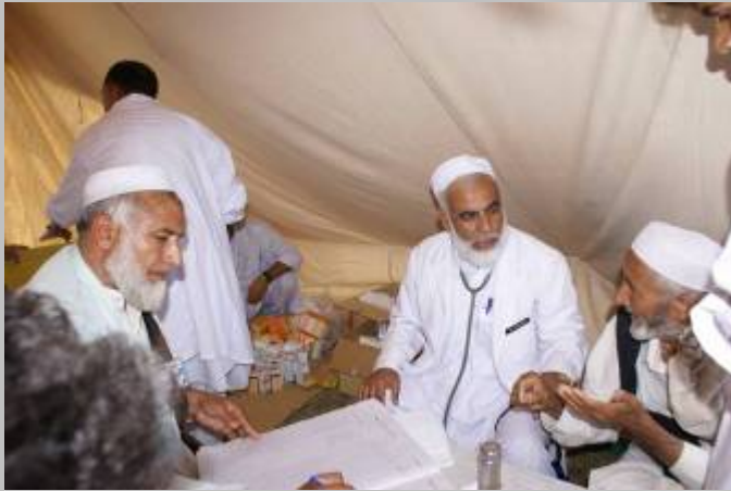
Health services in Sheikh Shahzad IDP camp, Mardan