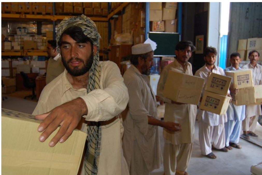
Loading medical supplies at the WHO Islamabad warehouse for delivery to flood-affected districts.