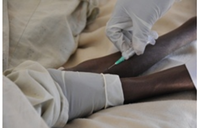
Collecting blood sample from a suspected yellow fever patient

19 November 2013 - Three suspected cases of viral haemorrhagic fever (VHF) in Kassala State were recently reported. A total of 40 suspected cases of yellow fever, including 10 deaths, were reported from 3 October up to 17 November 2013 in 13 localities in West and South Kordofan.