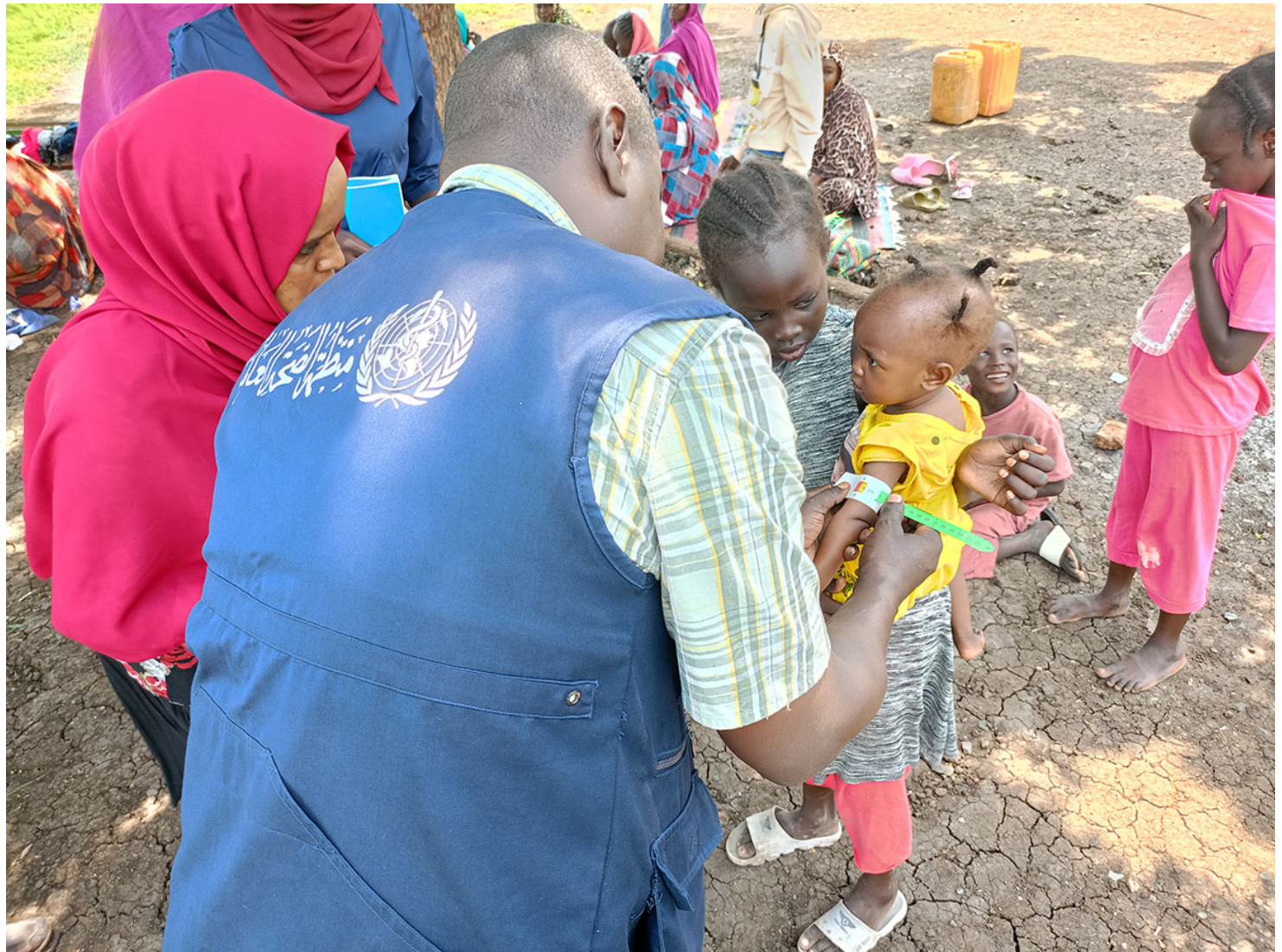
WHO support to the health emergency response for internally displaced people in Gedaref state, Sudan, in August 2023, during the ongoing conflict.