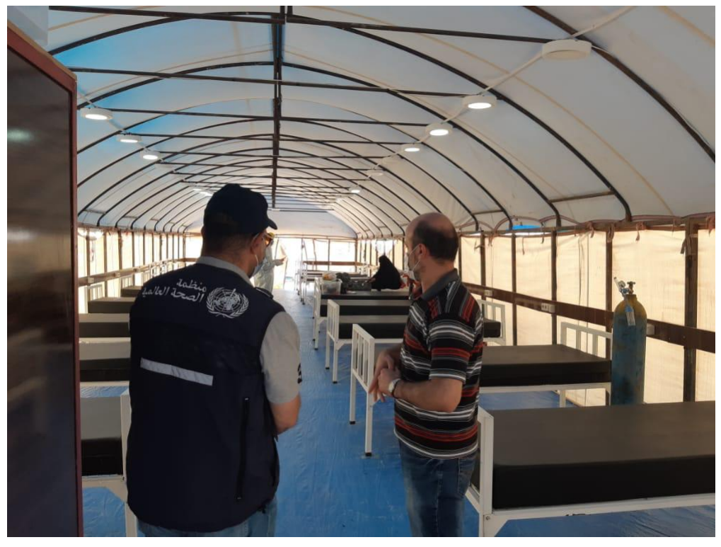
8 February 2021 - In 2020, the WHO Regional Office for the Eastern Mediterranean conducted a 3-month mission to Syria to provide technical support to the WHO country office and the Ministry of Health for their response to the COVID-19 pandemic, and to follow up on the implementation of recommendations from previous missions and support the Ministry to re-activate influenza-like illness (ILI) and severe acute respiratory infection (SARI) sentinel sites, and establish new SARI sentinel sites.

The mission, which took place from 7 August to 14 October 2020, also provided support to modify the COVID-19 case definition, revise the national testing strategy, and update case reporting for the COVID-19 surveillance system.