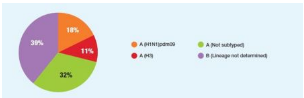
Fig. 3. Circulating influenza viruses in the Region by type, Epi week 9 to 12, 2017

During March 2017, national influenza centres in the Region and influenza laboratories tested a total of 1789 specimens for influenza viruses of which 139 (7.8%) tested positive. Among tested influenza viruses 87 (63%) were influenza A viruses and 52 (37%) were influenza B viruses (Fig. 3). Out of 87 influenza A viruses, 44 (51%) influenza A viruses were subtyped as follows: 29 (66%) were influenza A/H1N1pdm09 viruses and 15 (34%) were influenza A/H3 viruses.