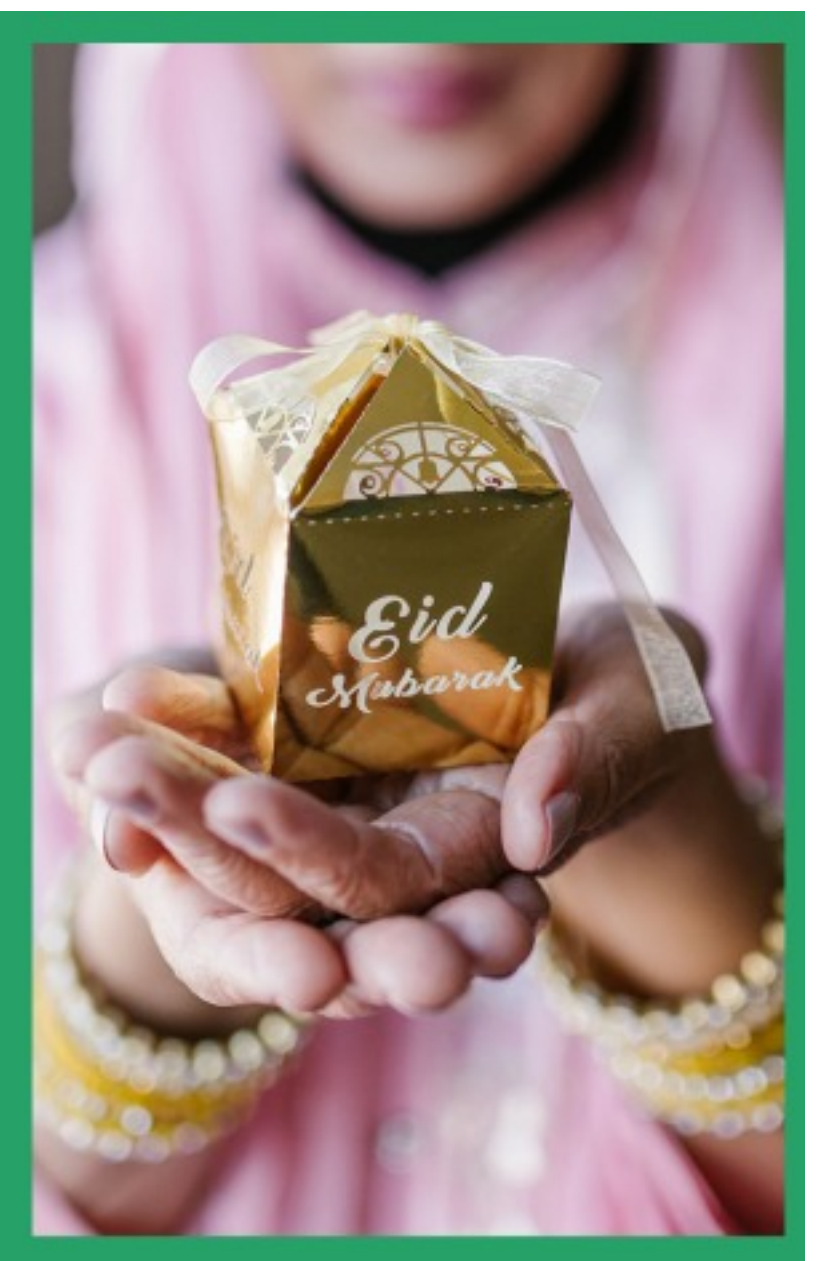
Tip of the week | Remain grateful and hopeful

We're back for the fifth and final week to share with you some more pointers and resources to help you care for your mental health and well-being as COVID19 persists and as you prepare for Eid Al-Fitr. Last week, we focused on reflection, meditation, and self-fulfillment. Did you find that you were calmer and more relaxed through prayer and? Were you able to change some of the thoughts or habits affecting your illustrated guide meditation? Did you try any breathing exercises or grounding techniques from our mental health and wellbeing? Did you get a chance to take a step back and reconnect with yourself?