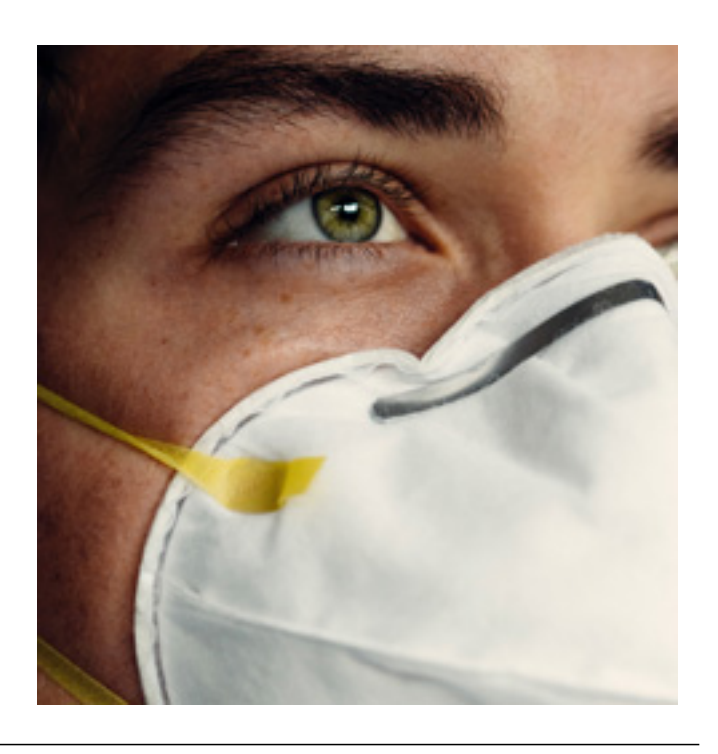
Protect your mental health: \square Mental health platform

Think of challenging situations that you and your community have experienced over the past few months. Notice how they helped you find new ways to work, relate to others, relax, contribute, and tap into your individual and collective resources. Remind yourself of the strengths that have helped you survive and thrive during those difficult times.