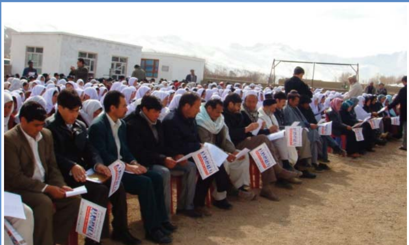
In the highlands of Bamyan, celebration pushed through with hundreds of students and health officials in attendance.