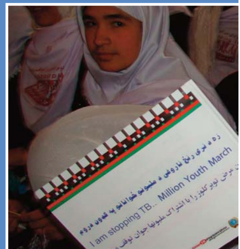
Jalalabad joined the rest of Afghanistan in the officials participating in a city motorcade and off during the celebration.