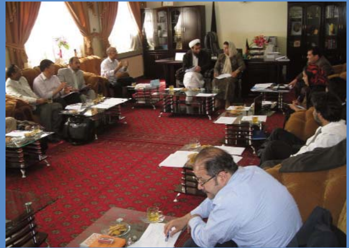
The National Stop TB Partnership endorses the ACSM Working Group's plan for immediate implementation

As a result of the awareness session with the Parliament Members, a one-day salary donation from the Members of the Parliament to TB patients has been planned.