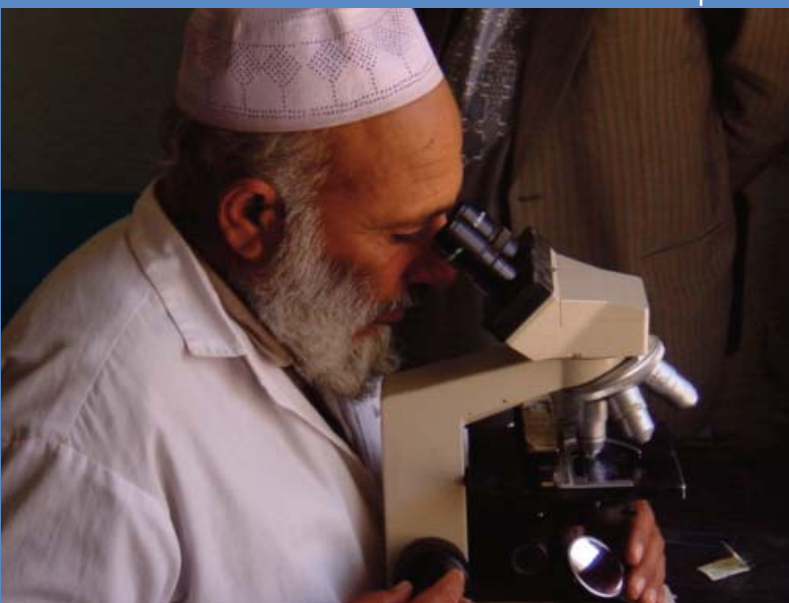
With CIDA's support, capacity building for National TB Program (NTP) at all levels will be given priority.

CIDA's support for 4 years (from 2008 to 2012) totals to $ 7,627,636.