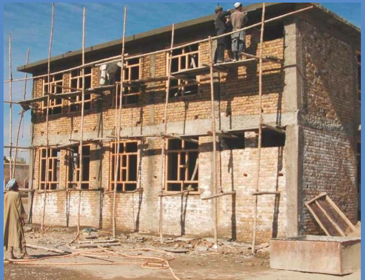
USAID supports the construction of the TB Center in Kandahar, Southern Afghanistan while CIDA grant ensures equipping of the center, an example of strong on-ground partnership.

This year, a model TB control with effective laboratory network including EQA and DST in the Southern Region (Kandahar and its neighboring provinces) will be established. This will lead to an increase case detection of sputum positive cases of TB by 10% each year (2008-2012).