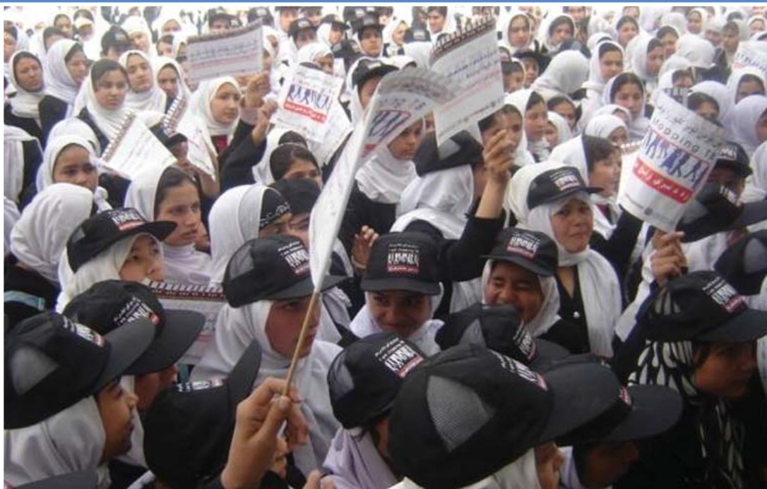
With full support from the Ministry of Education, millions of students celebrated the World TB Day 2009 in 34 provinces of Afghanistan on 11 March 2009.

The celebration in various parts of the country has confirmed that even amid security concerns, the people of Afghanistan meet in large numbers and unite on issues of health. The success of the World TB Day in Afghanistan reaffirms that the people of this country support those who suffer from tuberculosis as well as their family members.