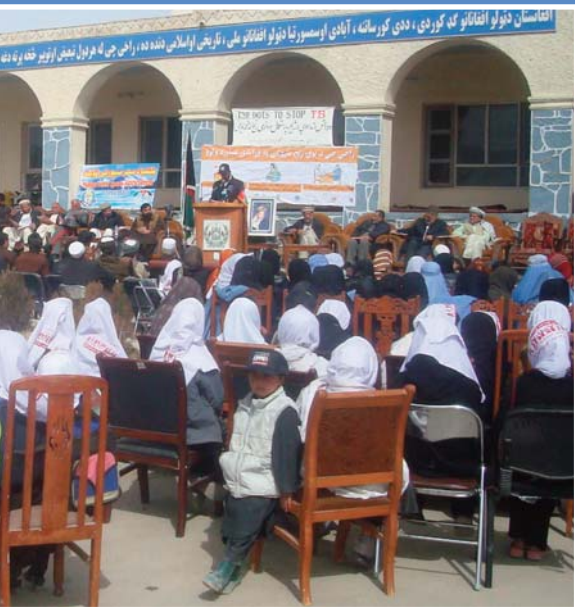
and students gathered in a secured park to take part and be