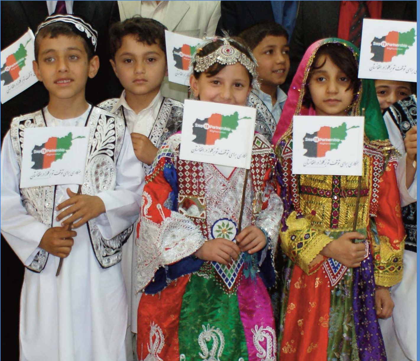
During the birth of Eastern Mediterranean Region's first sub-national stop TB partnership in Western Afghanistan, an originally composed song on the fight against tuberculosis was sung by a group of children. Dressed in their national costume, this group of school girls and boys of Herat waved partnership flags to the delight of those in attendance during the first meeting of the Stop TB Partnership in Western Afghanistan.

TB control program activities in Afghanistan are technically and financially supported by: