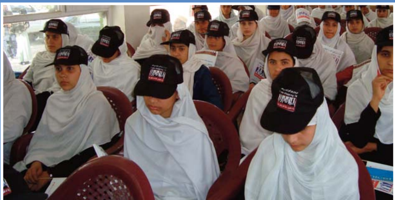
In the Northern city of Mazar, thousands of school children were made aware on tuberculosis during the commemoration of World TB Day.