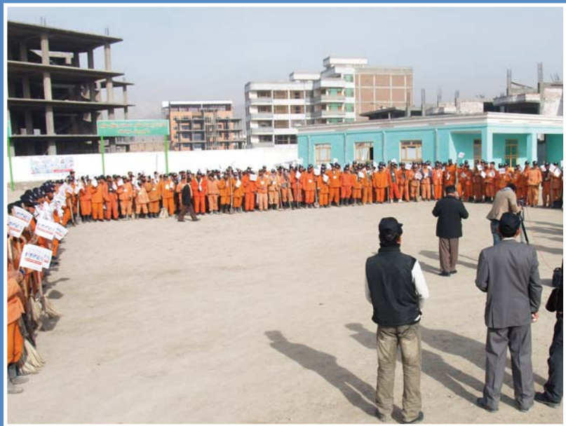
In the capital city of Kabul, the WTBD was celebrated with voices of students, women groups, government workers, and parliament members.