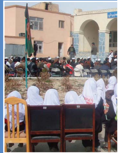
In Gardez, Paktia Province, government officials one with the global voice of stopping TB.