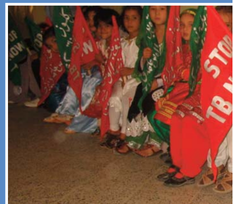
Kandahar's celebration maybe different from the outdoor celebration but just like other parts of successfully conducted.