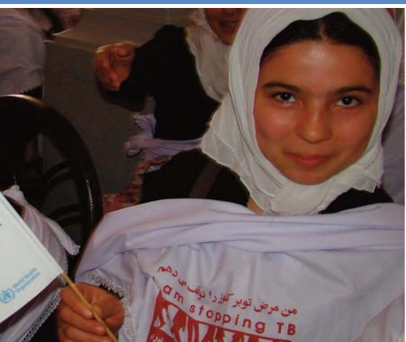
celebration with thousands of students, workers and health officials. Here shown a girl with stop TB flag and scarf