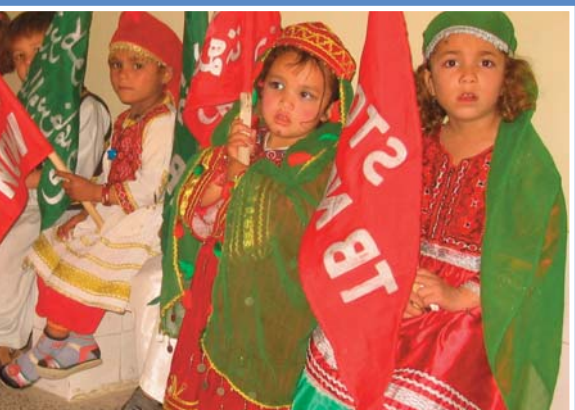
the rest of Afghanistan. The security situation did not allow an official commemoration of World TB Day was