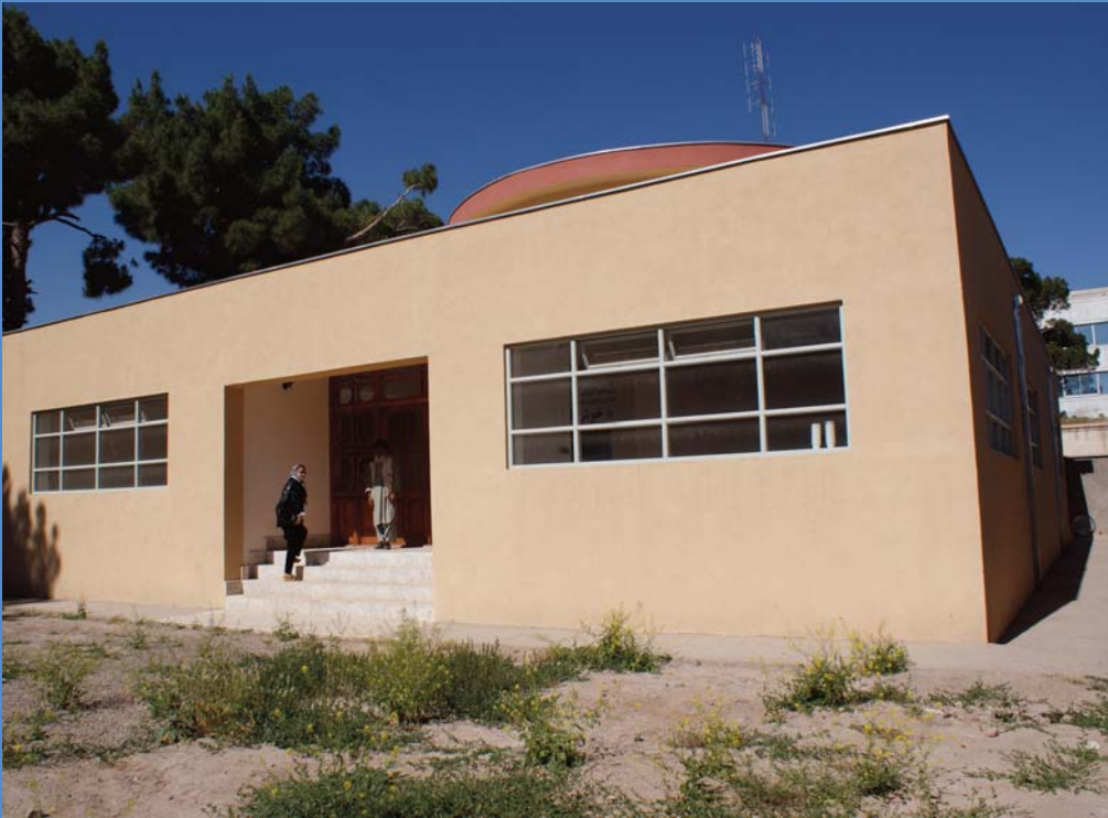
The Regional TB Training Center in Herat, Afghanistan funded by the Italian Cooperation

running costs for the regional reference laboratory and the training center; ensure training of health workers in the Western region; and support activities of regional and provincial TB coordinators. Gender focused interventions are being emphasized in 2009 with support from the Italian Cooperation. Taking into account that around 69% of the detected TB cases are females, there is a need of involving more female community volunteers to take deal with the gender issues.