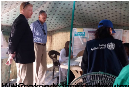
WHO experts advise disease control ministry