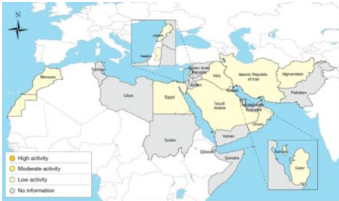
Fig. 1. Influenza activity in the Eastern Mediterranean Region, June 2017

In the WHO Eastern Mediterranean Region, influenza activity remained low in June 2017 in countries reporting data to FluNet and EMFLU namely, Afghanistan, Bahrain, Egypt, Islamic Republic of Iran, Iraq, Lebanon, Morocco, occupied Palestinian territory, Oman, Qatar and Saudi Arabia (Fig. 1). All seasonal influenza subtypes were detected in the Region.