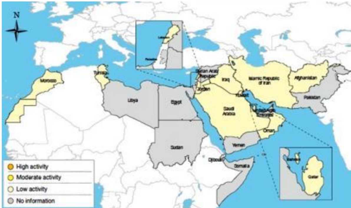
Fig. 1. Influenza activity in Eastern Mediterranean Region, April 2017 Influenza activity by sub-type

9 May 2017 – In the WHO Eastern Mediterranean Region, influenza activity for the month of April 2017 remained low in countries of the Region reporting data to FluNet and EMFLU namely, Afghanistan, Bahrain, Islamic Republic of Iran, Iraq, Jordan, Kuwait, Lebanon, Morocco, Oman, Qatar, Saudi Arabia, and Tunisia (Fig. 1). All seasonal influenza subtypes were detected in the Region.