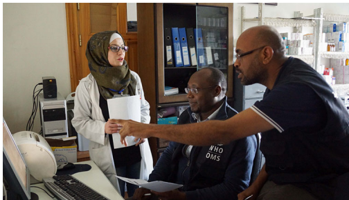
WHO early warning experts assess Syria's early warning disease surveillance system

Early warning systems for disease outbreaks are surveillance systems that collect information on a selected list of epidemic-prone diseases in order to trigger prompt public health interventions. They function in humanitarian emergency situations when the routine public health surveillance systems of a country are underperforming, disrupted or non-existent. Early warning systems are often set up to fill such temporary gaps, while the routine systems recover from the effects of the disaster or a crisis. During humanitarian emergencies, detecting and responding swiftly to epidemics is key in order to reduce unnecessary illness and death, especially among refugees and displaced people.