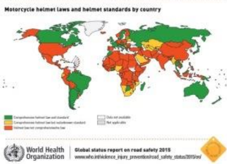
Motorcycle helmets: the facts [pd 852kb]