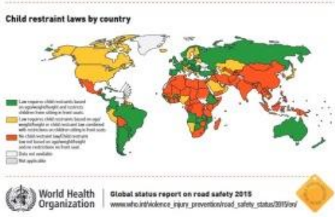
Child restraints: the facts [pdf 829kb]