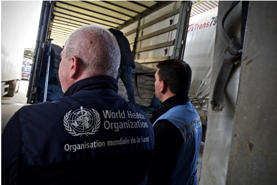
Emergency kits, intravenous solutions and protective equipment, such as masks have been shipped into northwest Syria from Turkey to better prepare health partners for COVID19