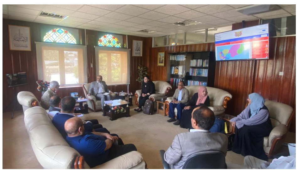
A consultative meeting between WHO and Yemen's Ministry of Health and Population, Sana'a

Cairo, 1 November 2022 – The Infectious Hazard Prevention and Preparedness programme at the WHO Regional Office for the Eastern Mediterranean recently deployed an expert to Yemen to support strengthening surveillance for influenza and respiratory pathogens.